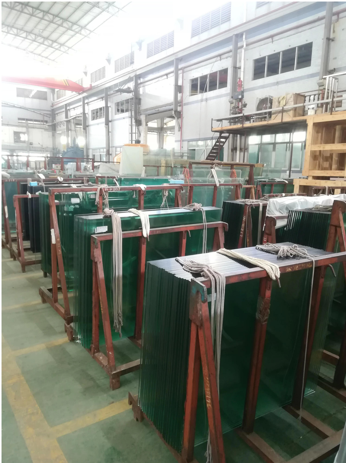
Tempered glass safe wood package..