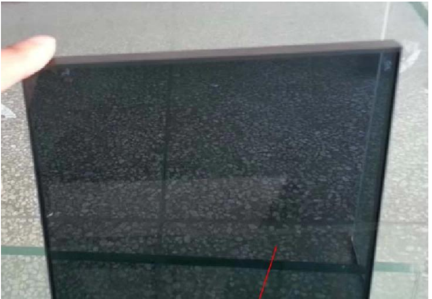
Tempered glass mass production..