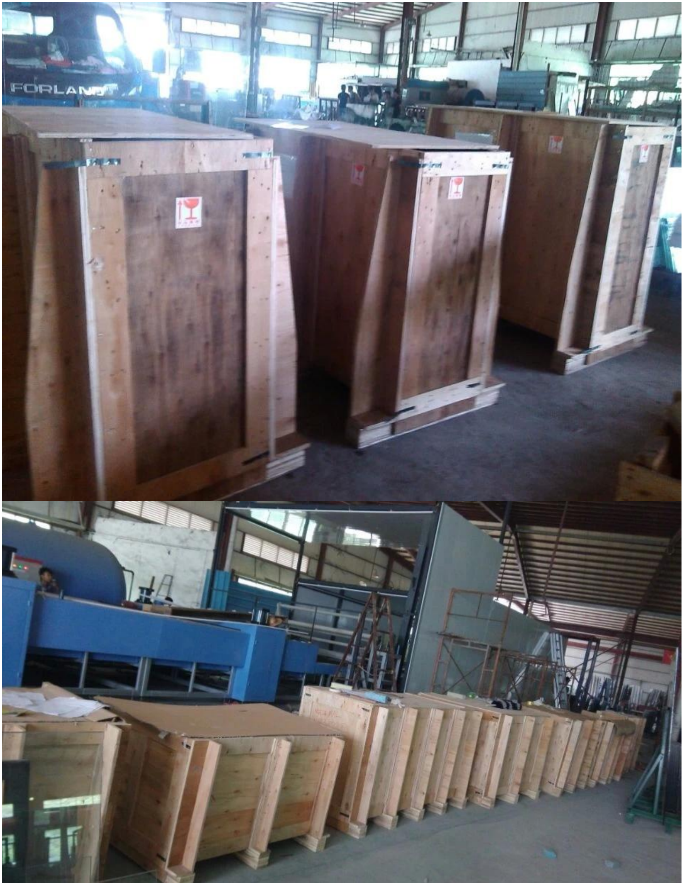
Tempered Glass Projects