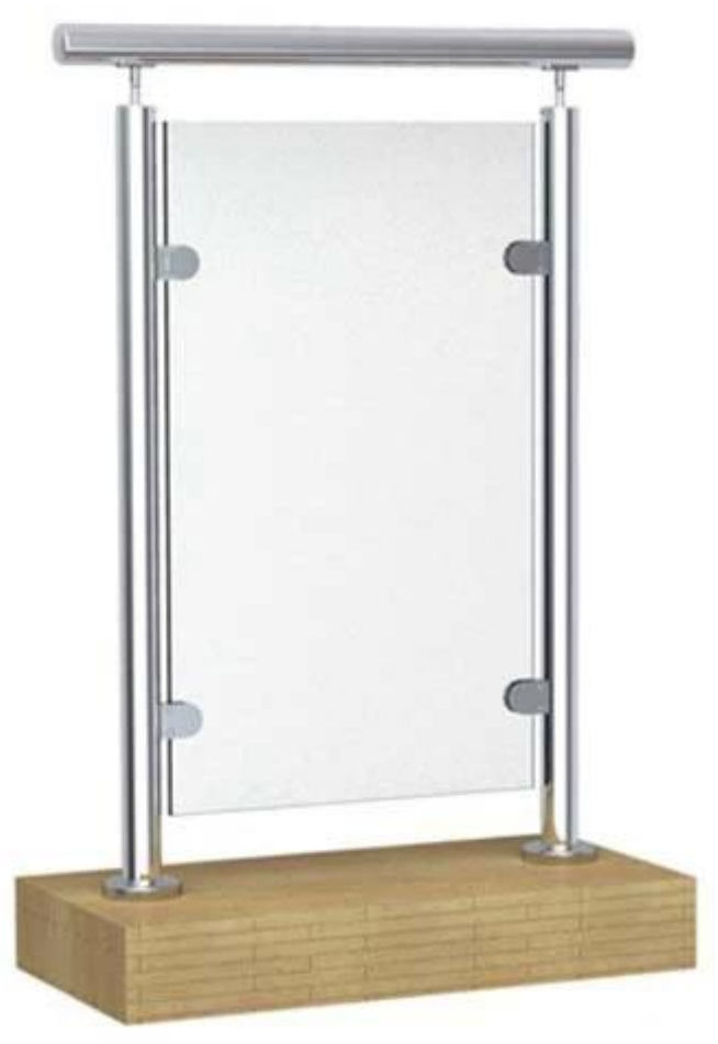
^{\circ} central 2-way spindle LCH-107: