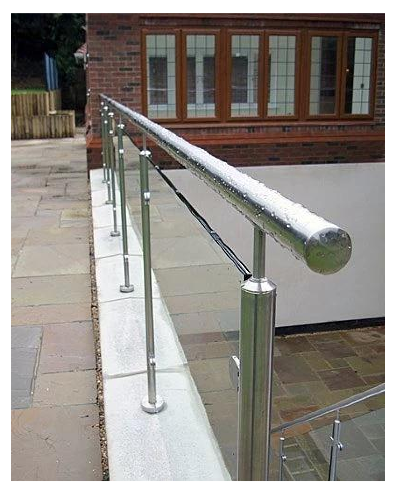
Stainless steel handrail for outdoor balconies / bridge / railing Terrance Design: