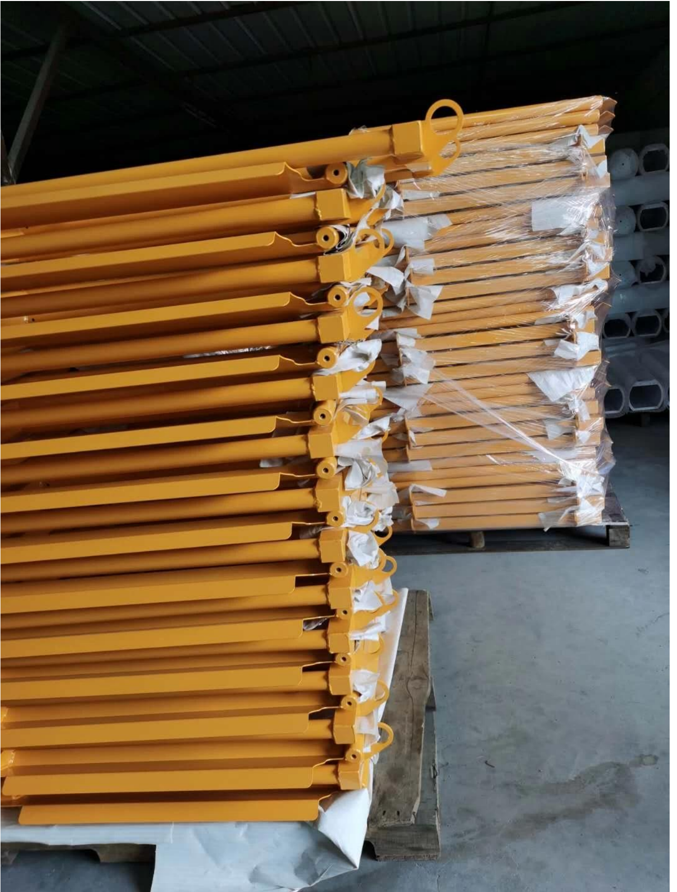
# Aluminum safety handrails applied in railway stations -