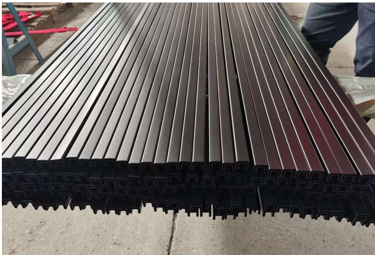
Electroplate black stainless steel balustrade tube pipe