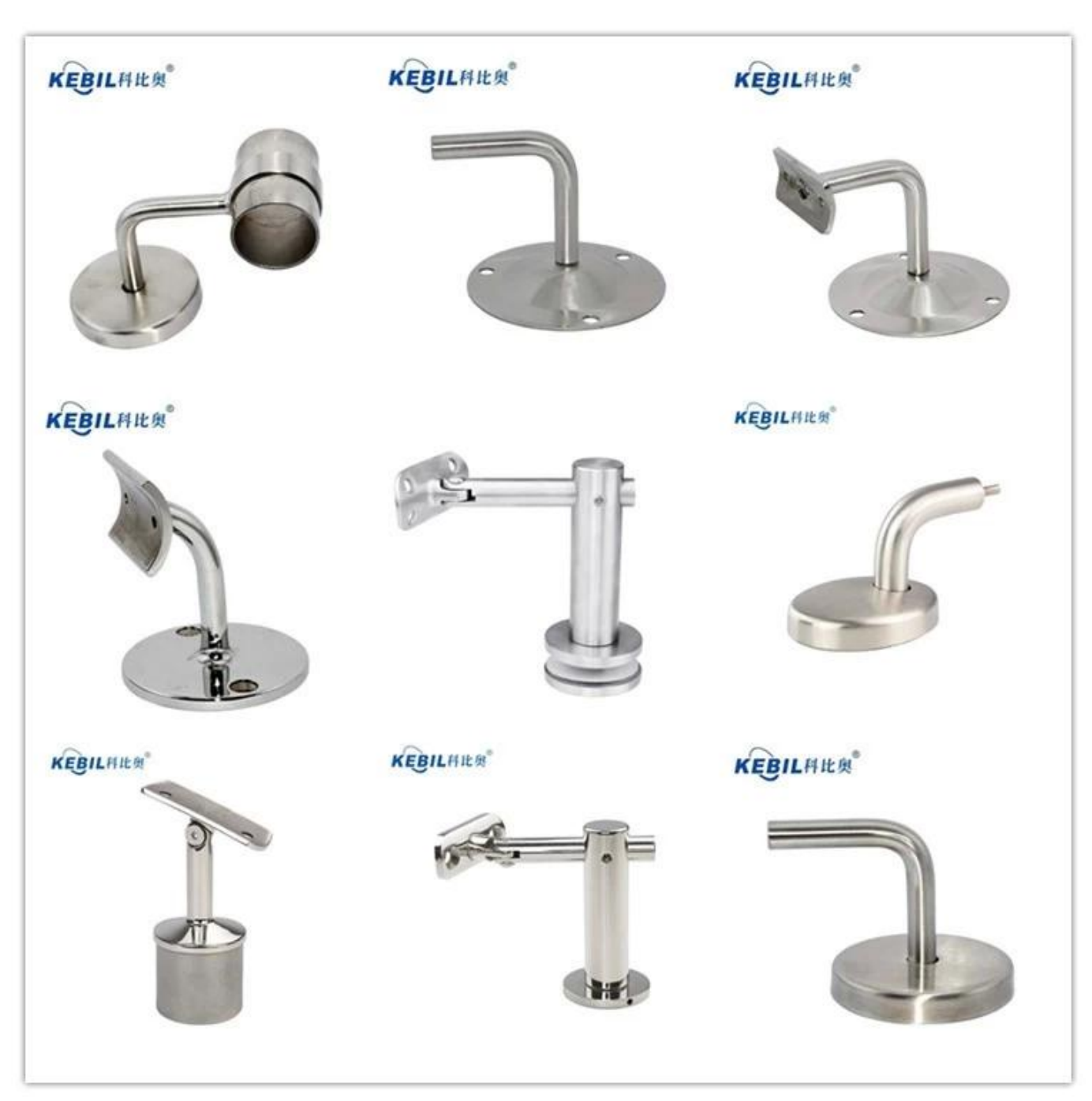
Handrail Bracket ProjectPhotos