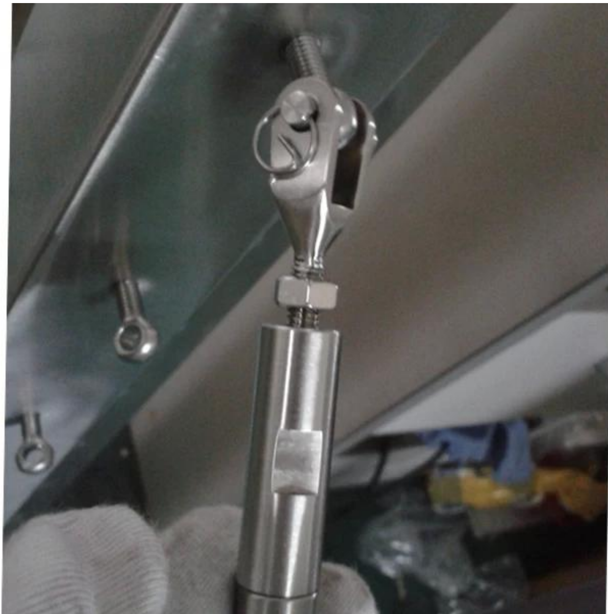
Cable fitting T803 size