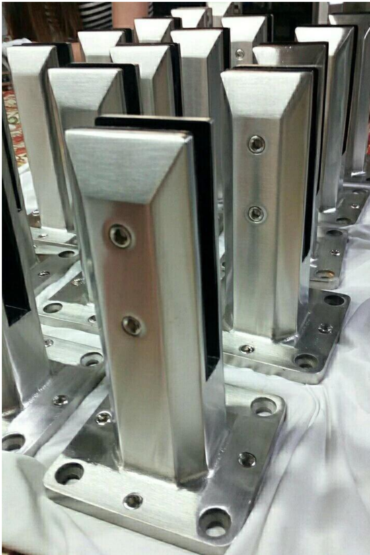
Semi-finished adjustable balancing glass spigot photos :