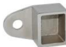
square top raip fittings