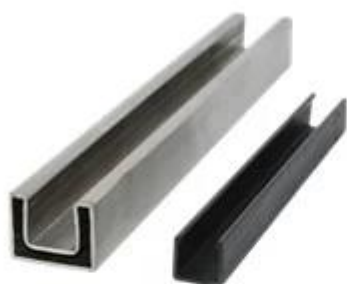
mini top rail