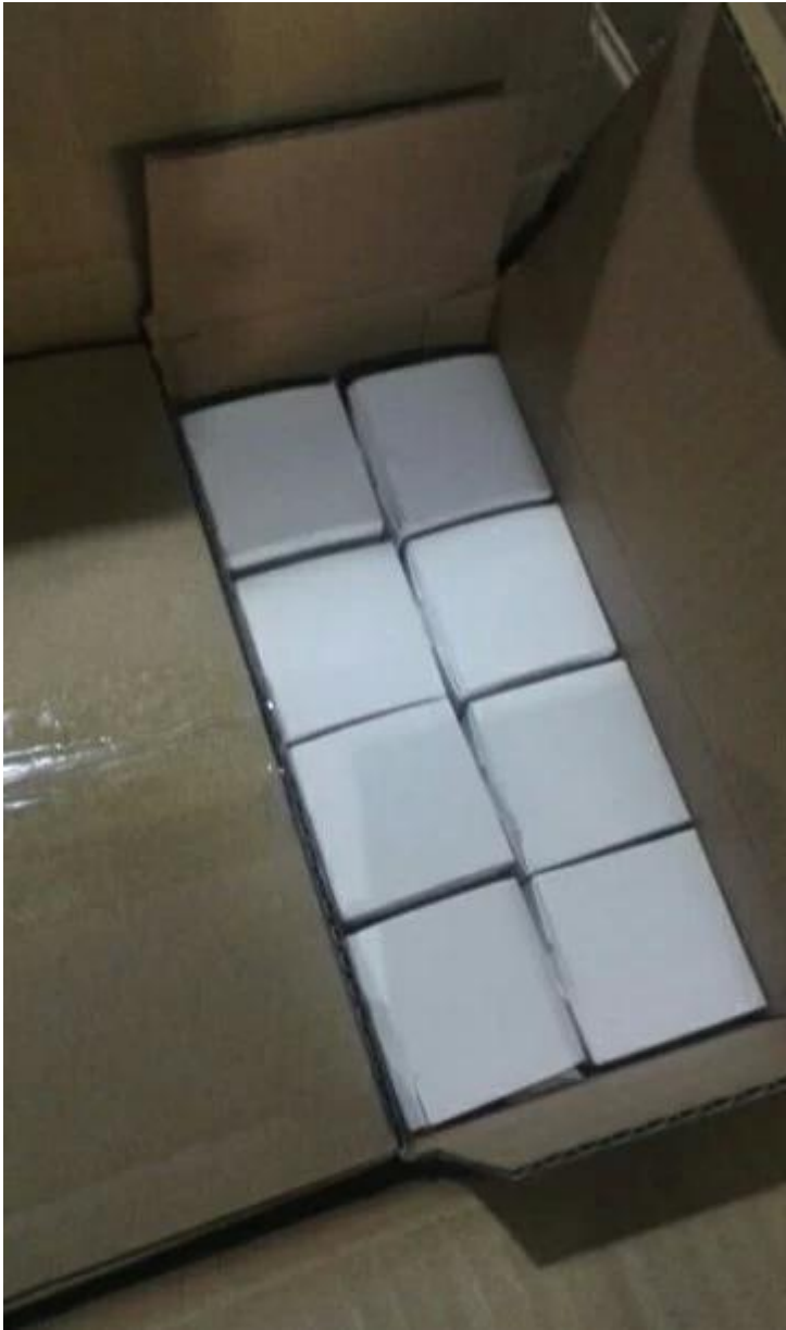
Project photos with adjustable stainless steel threaded round standoff for glass