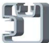
Square 2 way 90 degree