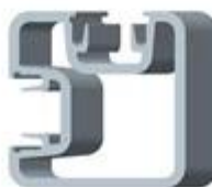
Square 2 way 90 degree