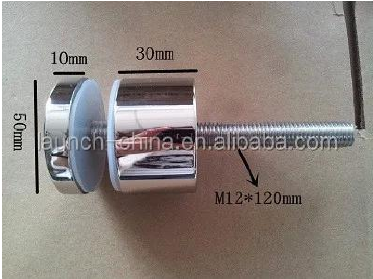
3. Model No. SF-50T standoff.