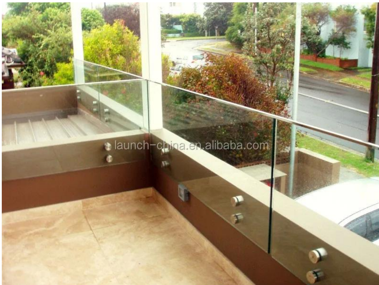
2. Staircase stainless steel standoff glass railing design