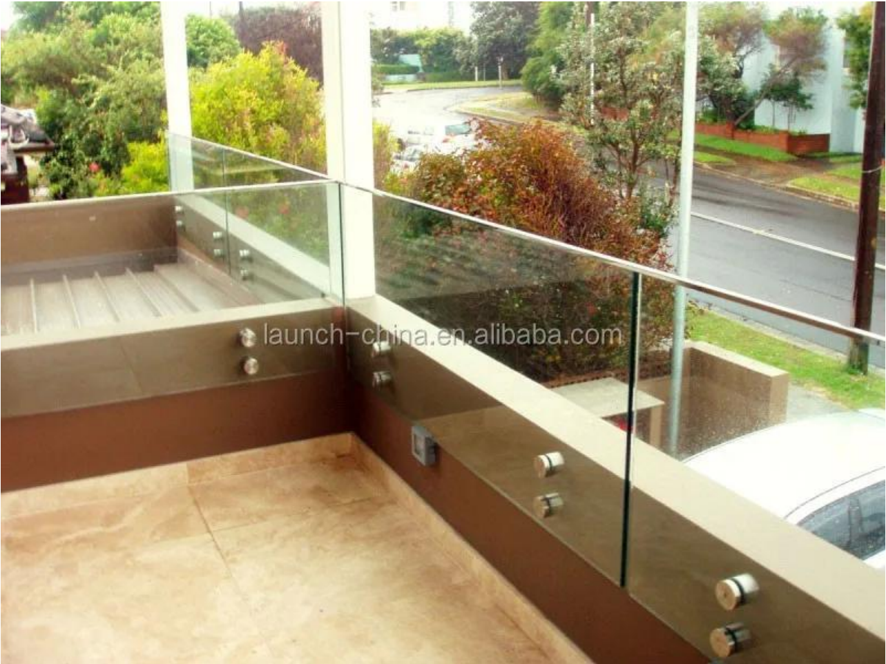
2. Staircase stainless steel standoff glass railing design