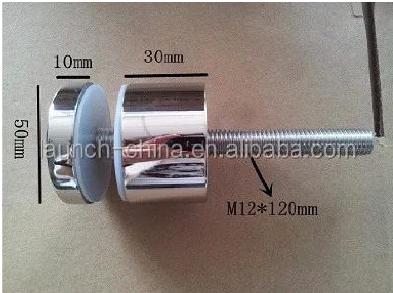
3. Model No. SF-50T standoff.