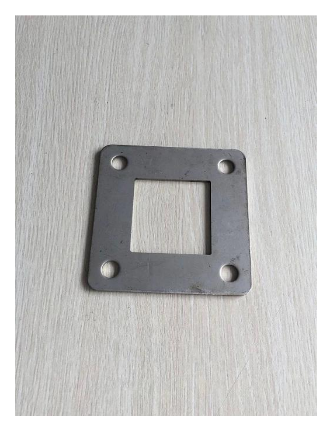
Model No.: CP113