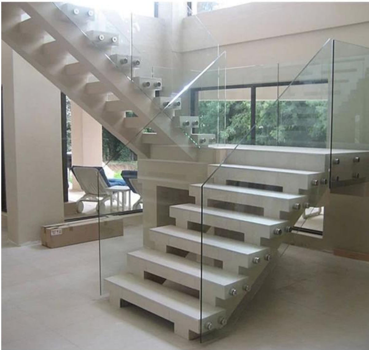
Other design for glass standoff glass standoff for timber decking