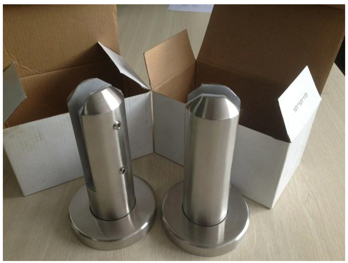
3.Project pic round clamp for swimming pool fencing,timber decking