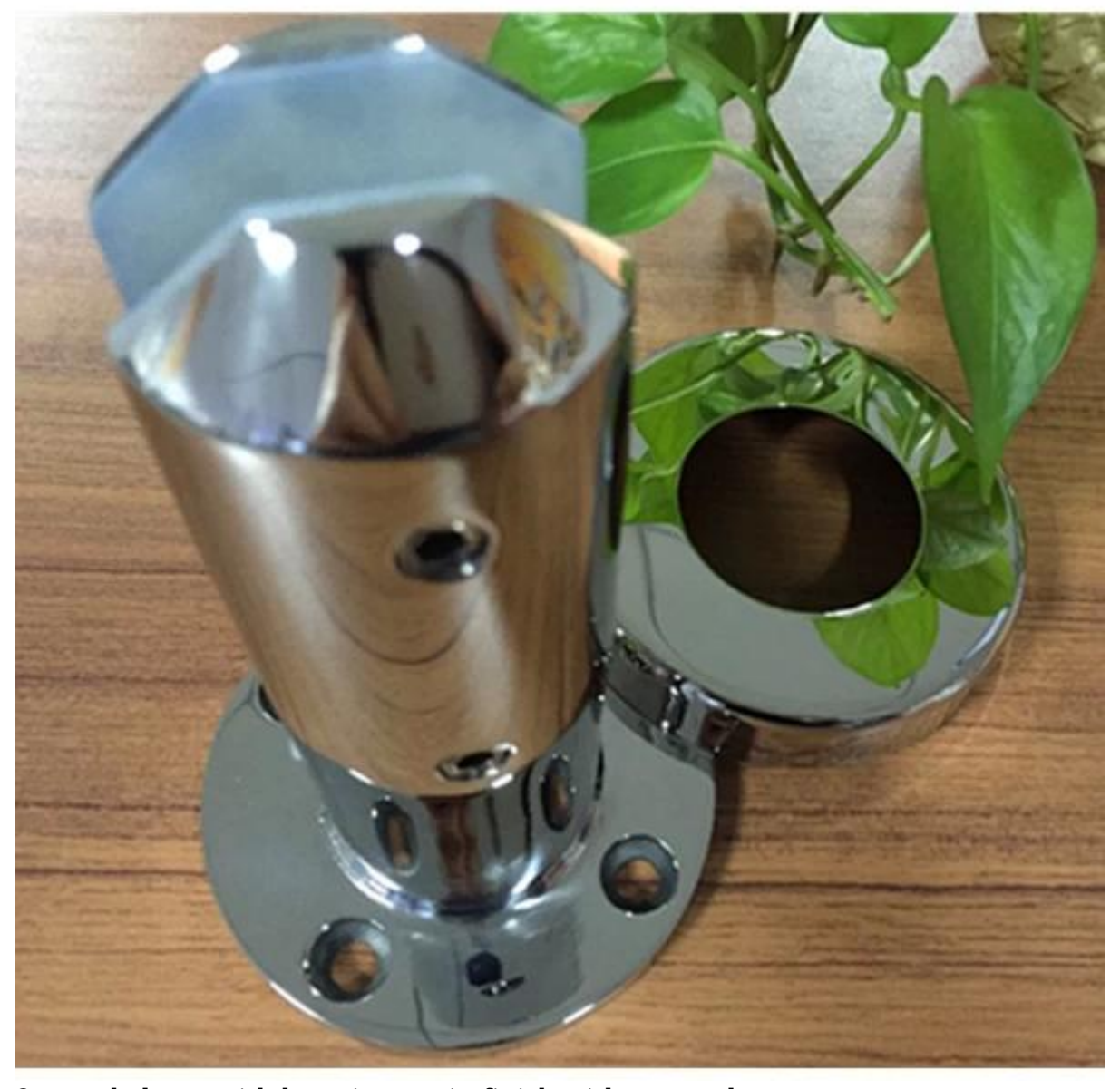
2.round clamp with base in a satin finish with cover plate

1.round clamp with base in a mirror finish with cover plate