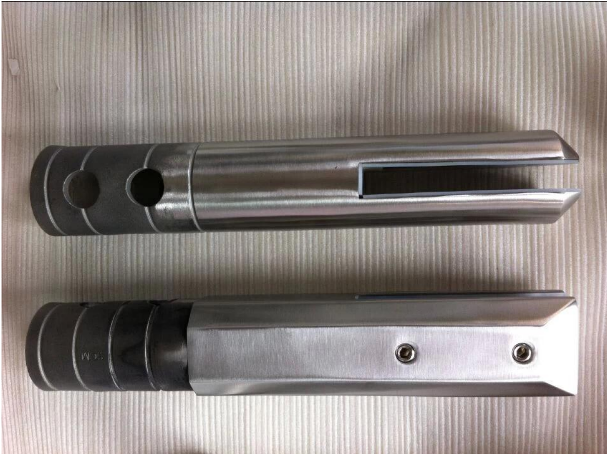
4 types stainless steel glass clamp base plate and core drill type