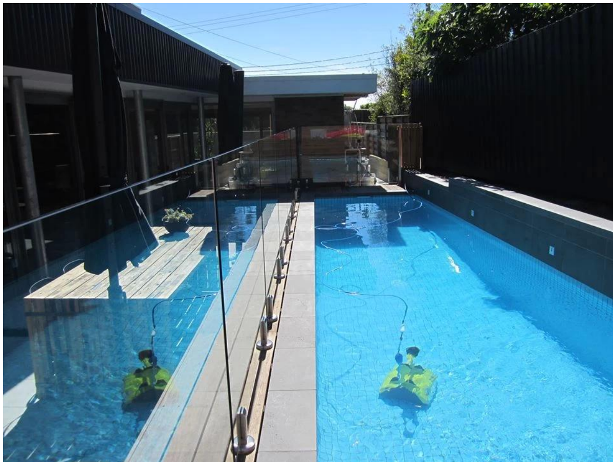
2.stainless steel glass handrail system with glass clamp stainless steel glass square railing post for balcony,stainless steel 316 glass balustrade post for pool fence