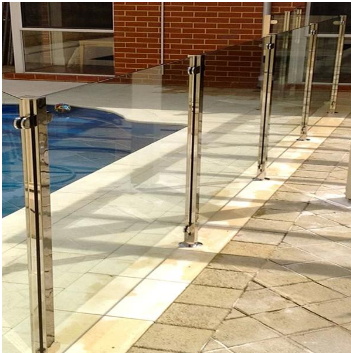
stainless steel square type glass clamp for stair, stainless steel glass clamp with flat base for balcony handrail