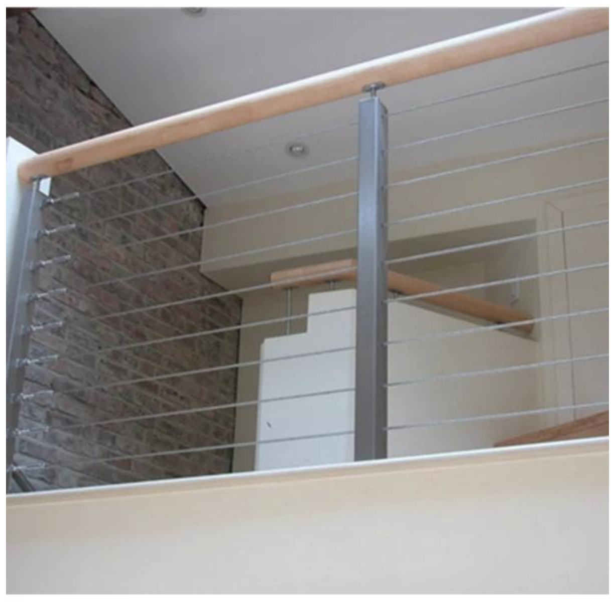
This is Susie Fu ^{-} and welcome to contact me for more details. We are one-stop factory for stair project.