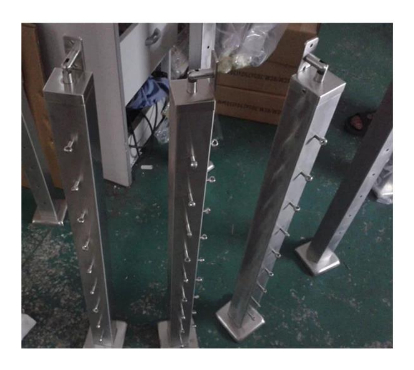
4.projecct pic of stair cable railing system stainless steel cable railing system with stainless steel handrail