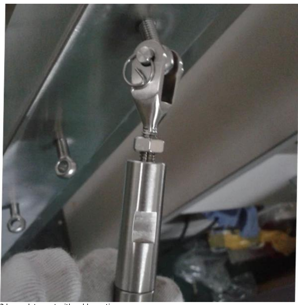
3.base plate post with cable section