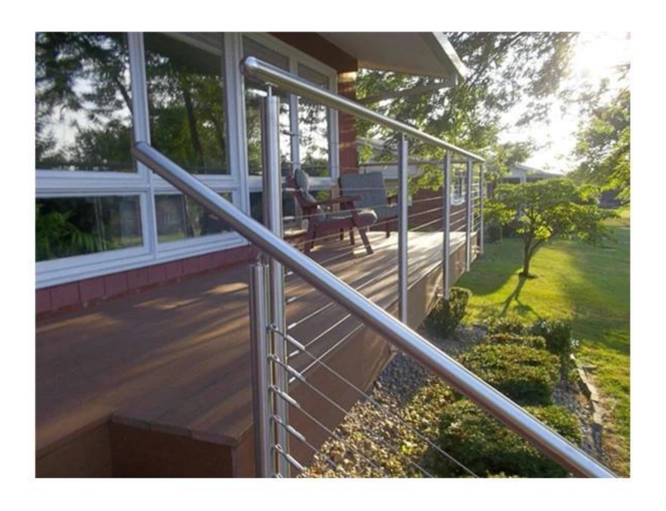
wire rope railing system

6. wire rope system for balcony available