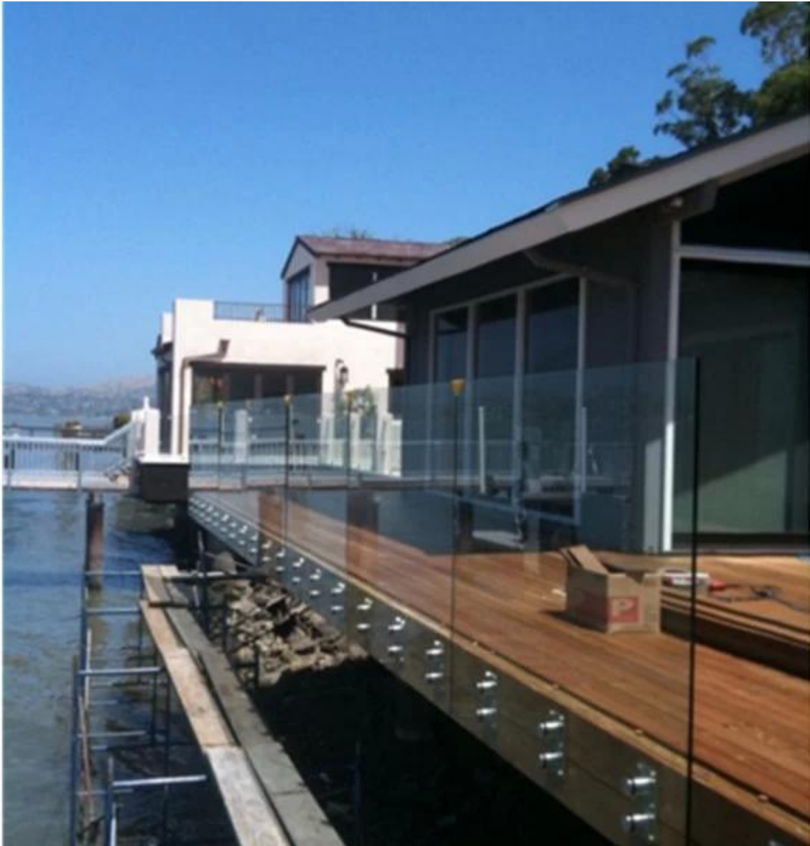
Other designs of standoff glass bracket 1.glass standoff concrete decking