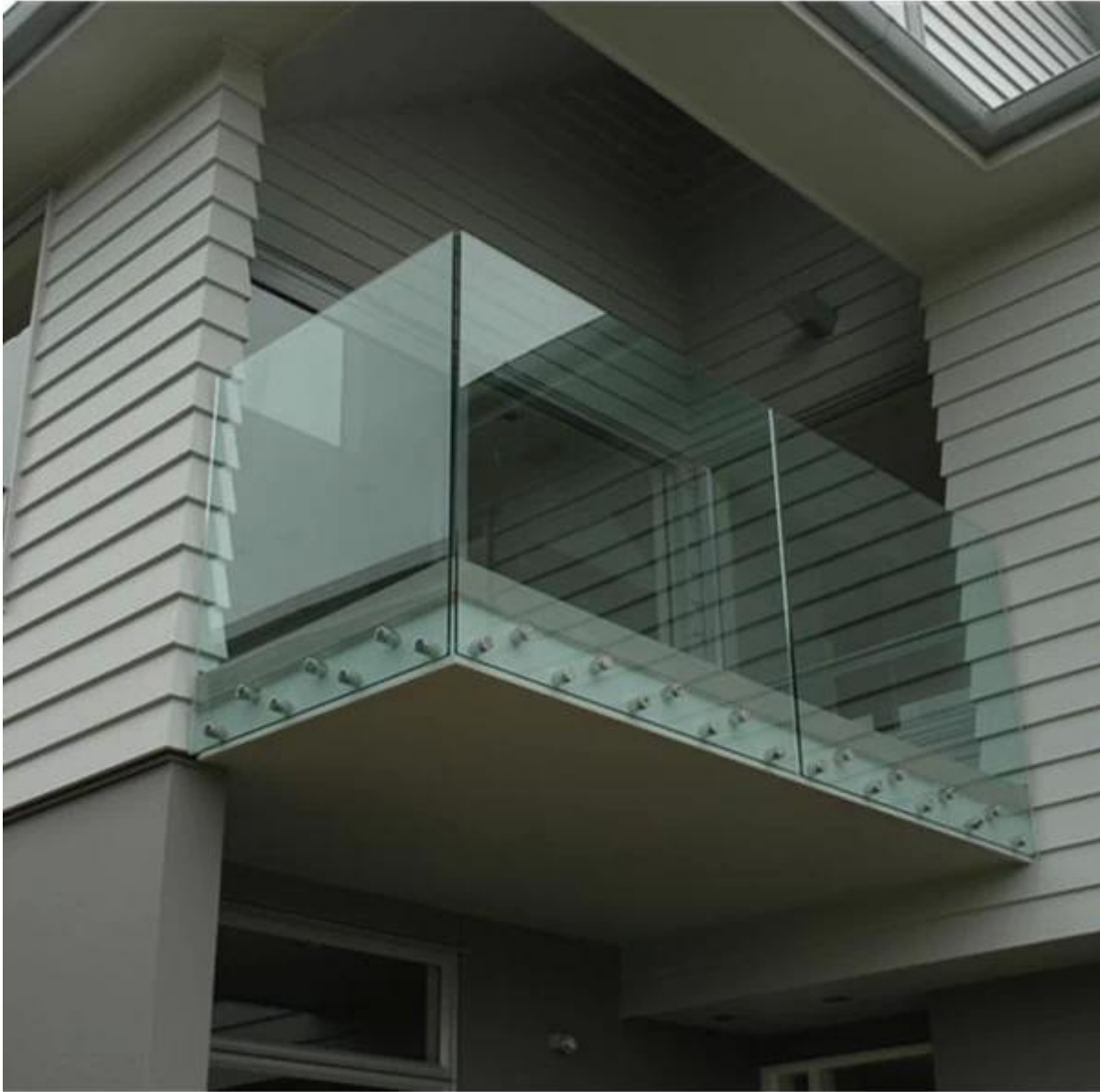
2.glass standoff bracket timber decking