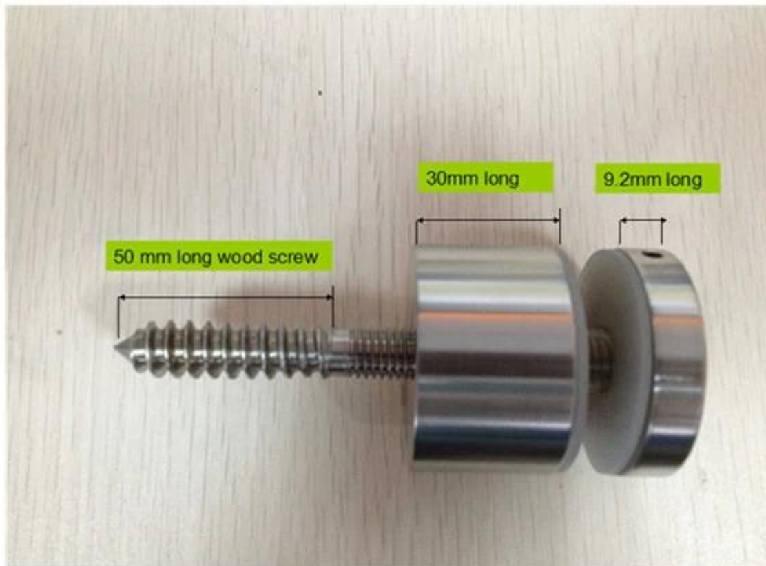
glass standoff SFT-30