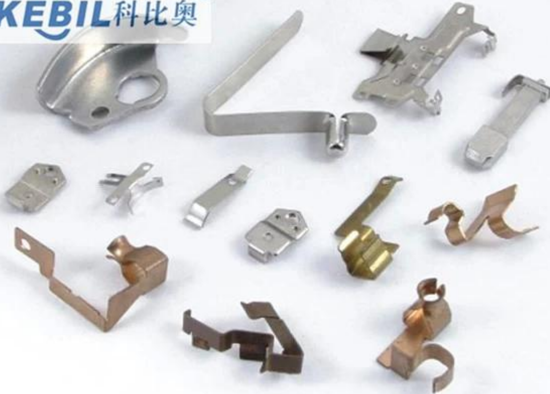
sheet metal stamping part