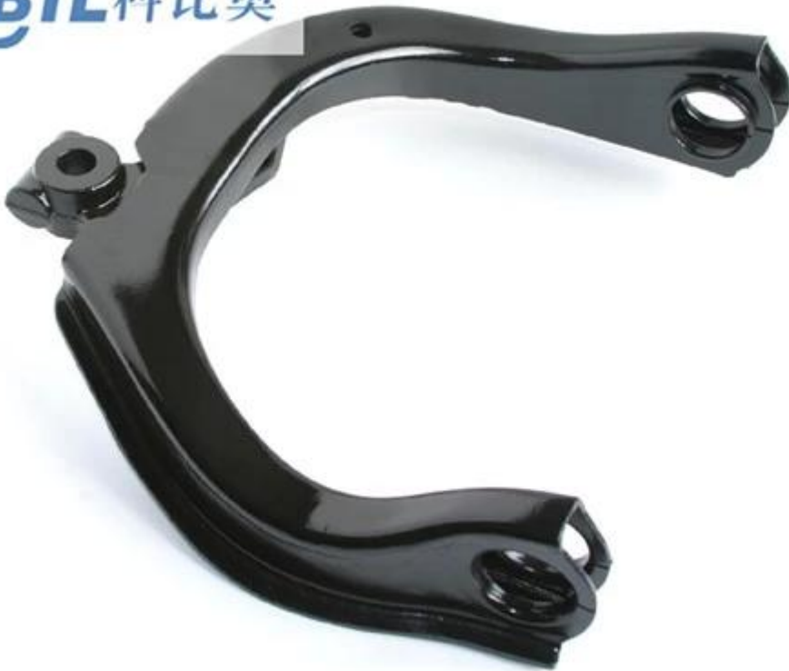
sheet metal stamping part