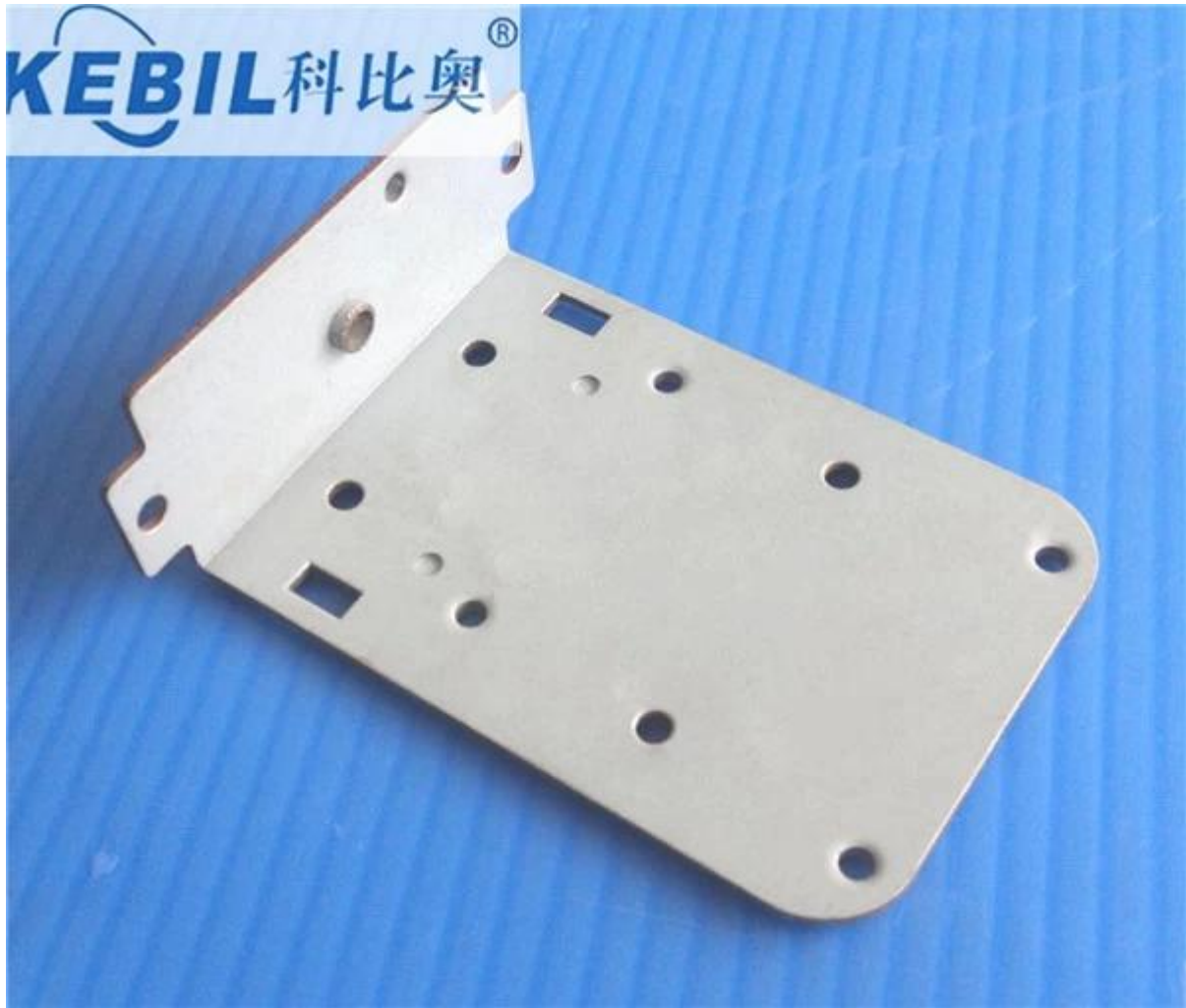
sheet metal stamping part