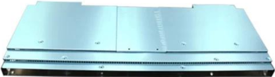
sheet metal stamping part