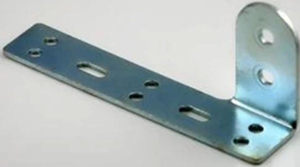
sheet metal stamping part