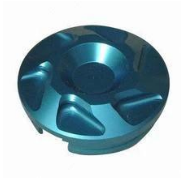
stainless steel cnc machining parts