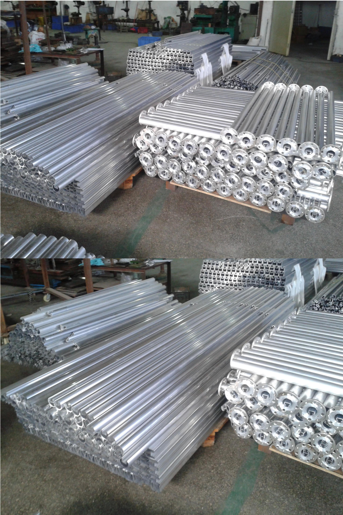
project pic grey color