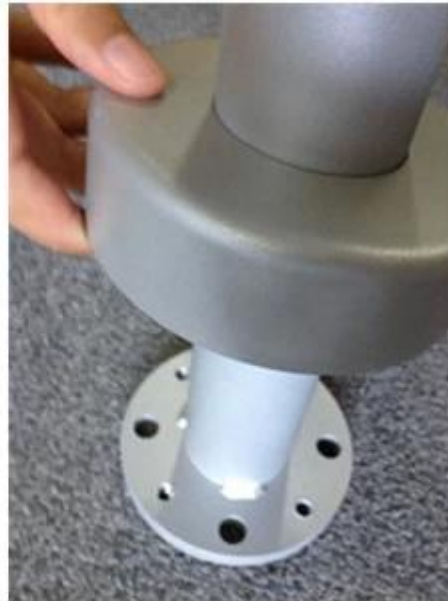
base plate type aluminum handrail post,silver color, in the workshop