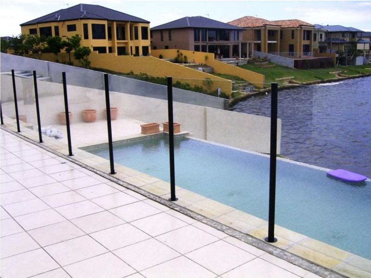
square aluminum post