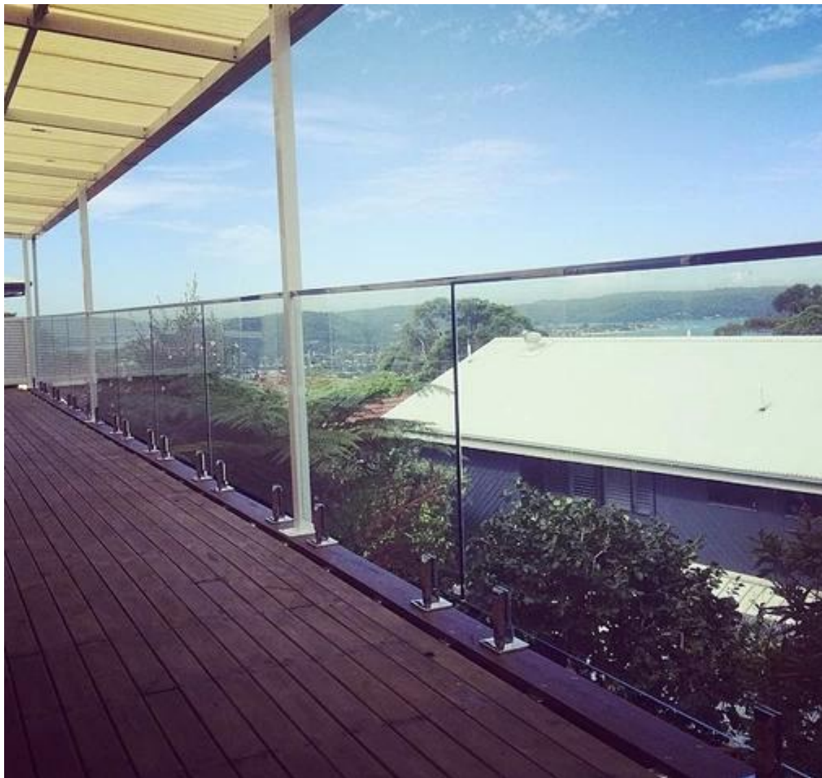
2). stainless steel handrail slot tube outdoor deck glass railings: