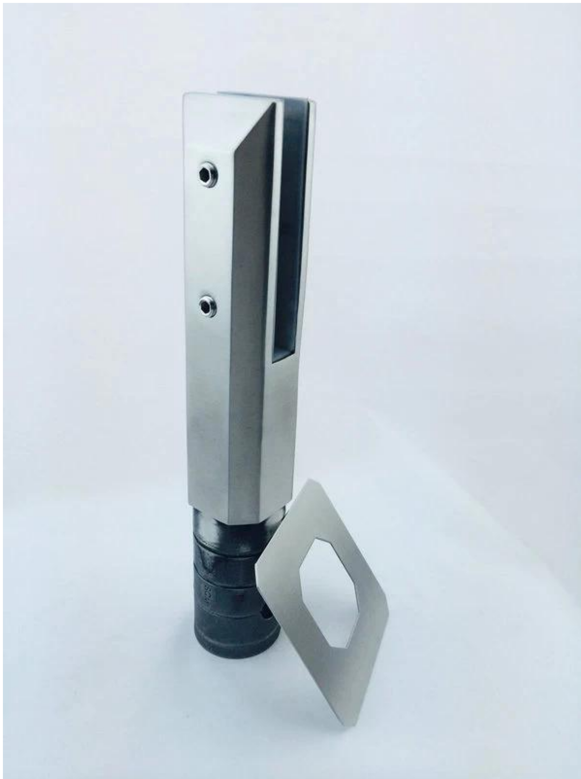
Mirror polished SCM-2 glass fence spigot; Material: Marine grade Duplex 2205, or stainless steel 316