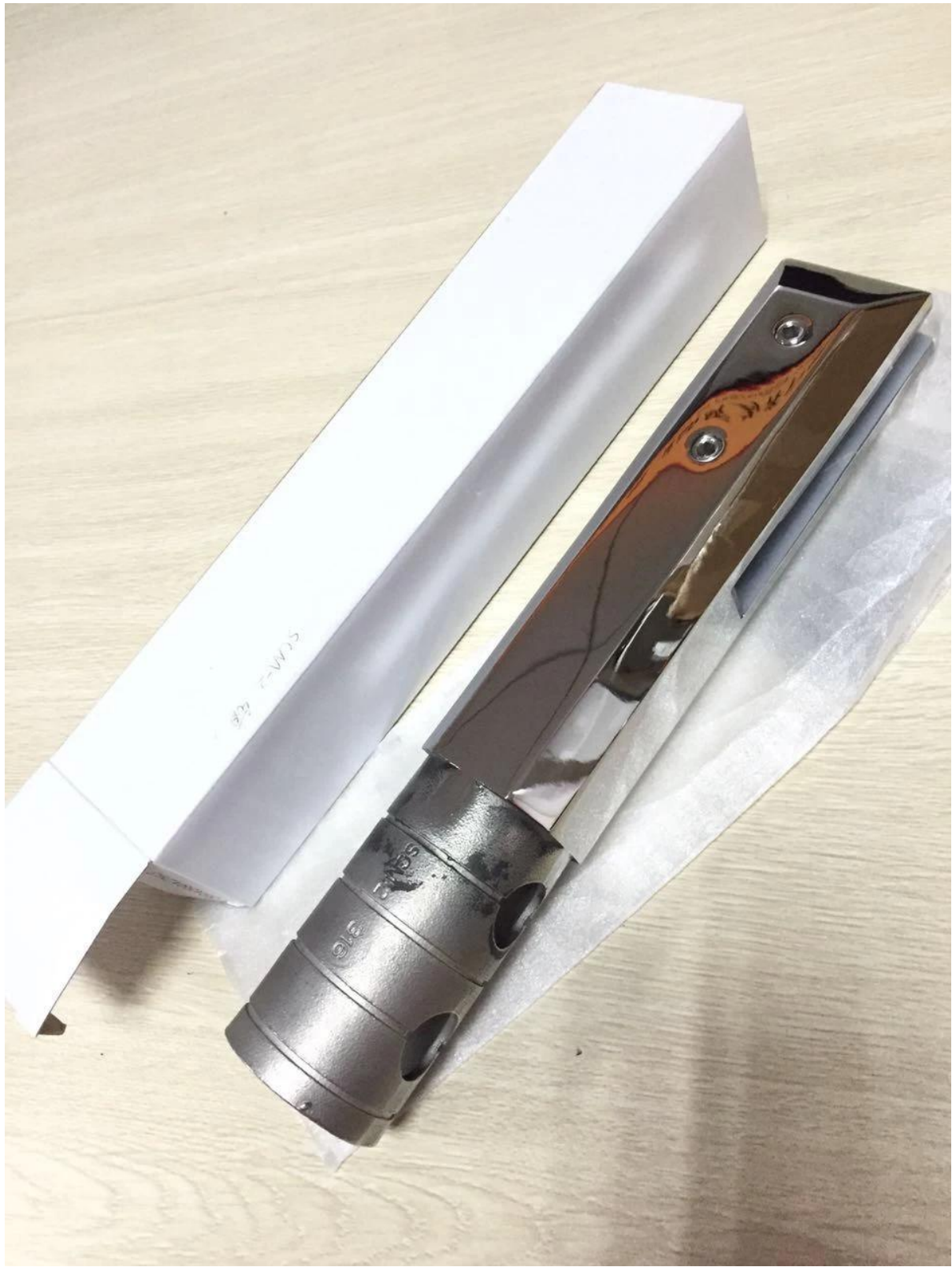
Project for outdoor pool fencing;