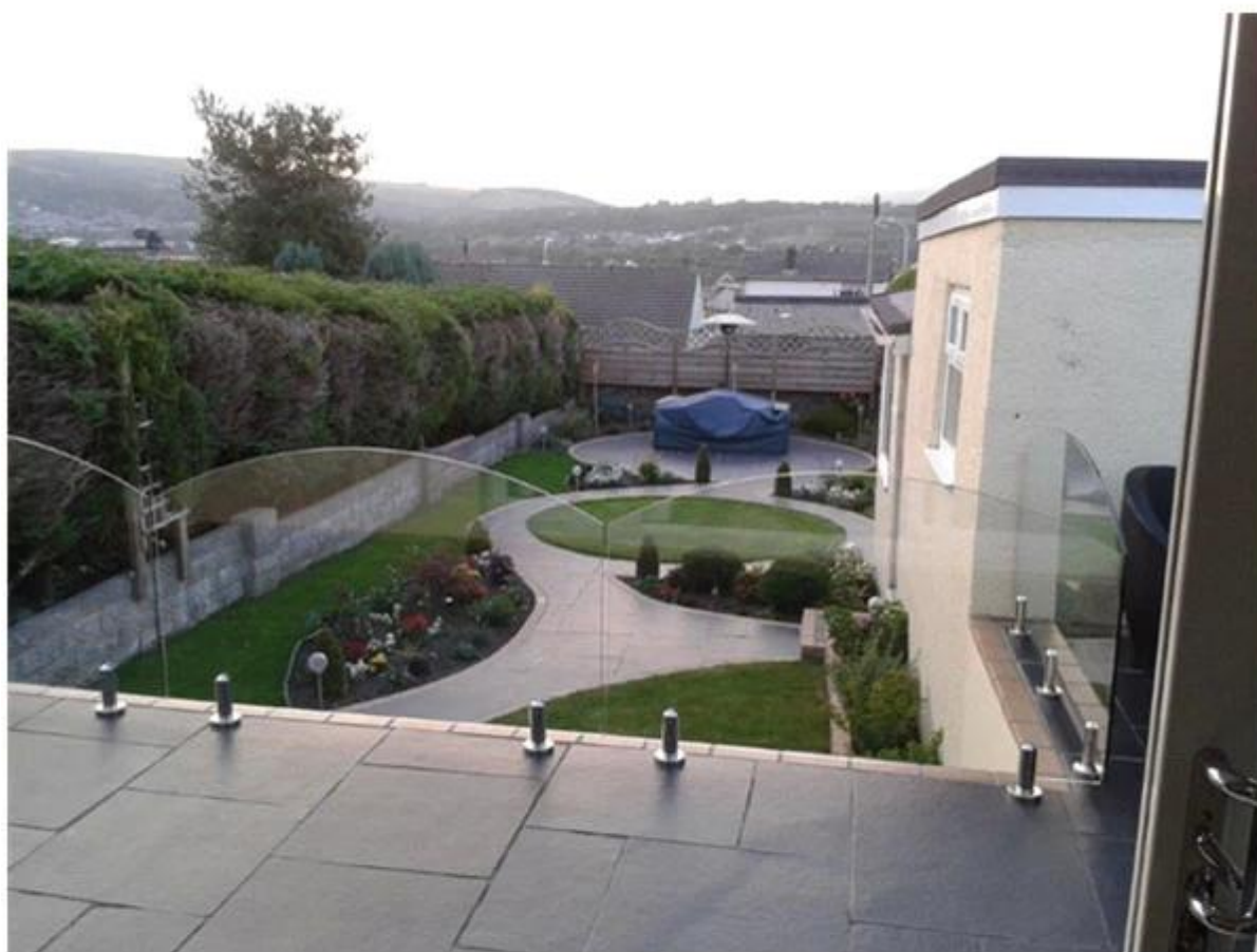
glass balustrade system