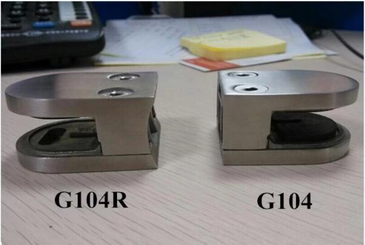
stainless steel glass clamp installation :