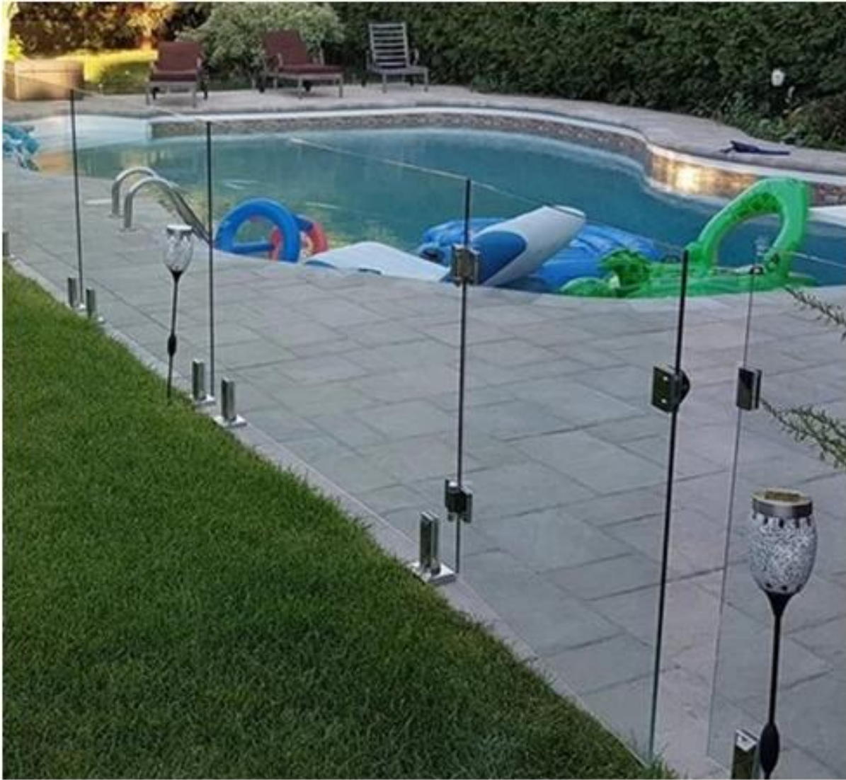
pool fencing spring loaded stainless steel 316 glass door hinge standard glass panel holes position drawing.