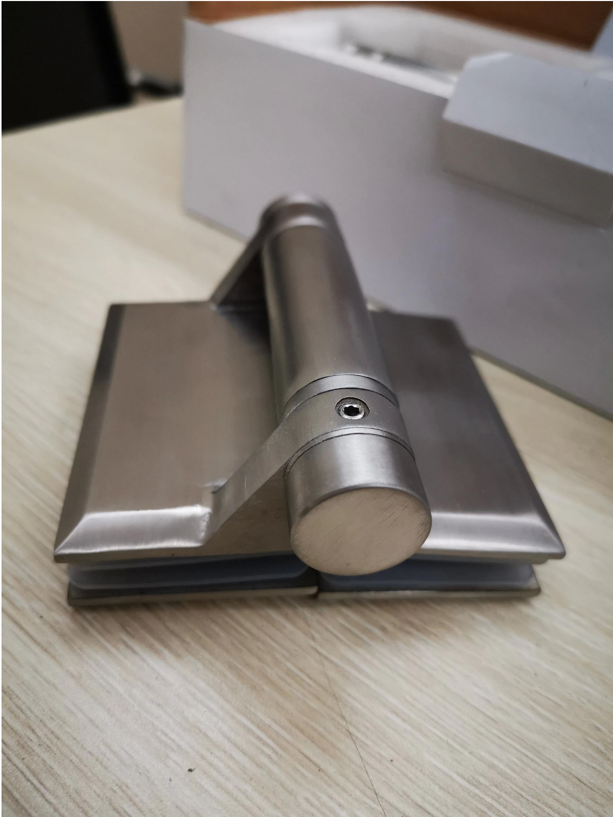
3. Model No. G-W2, glass to square post / wall hinge.