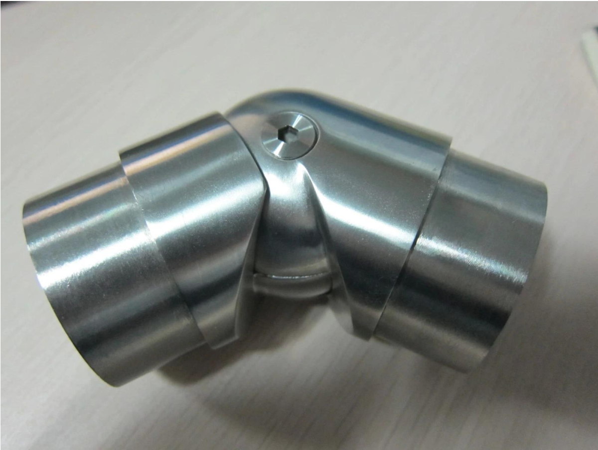
E302 90 degree elbow