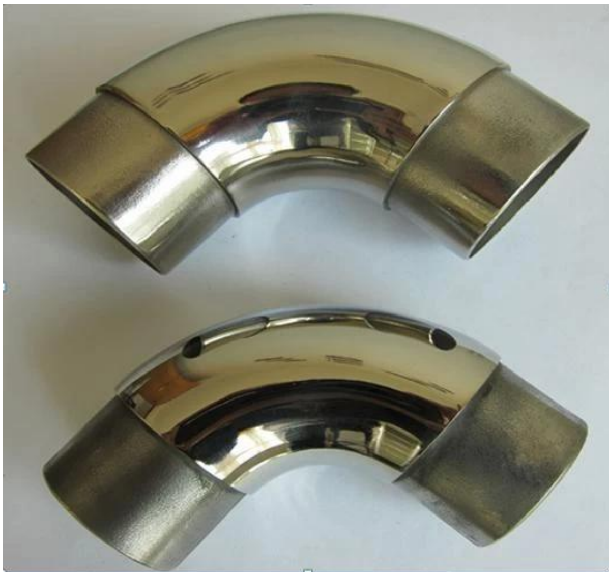
E304 middle tube elbow