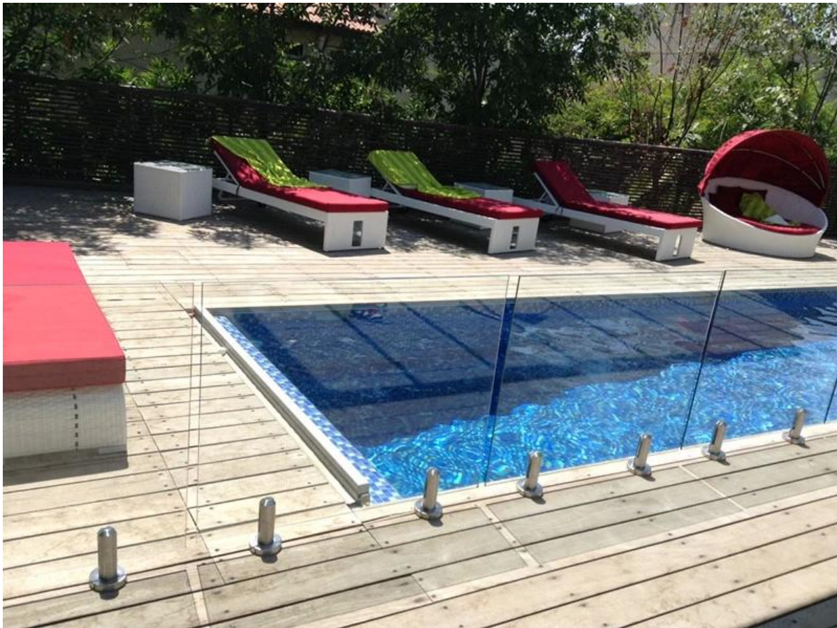
glass hinge stainless steel 316 glass door hinge for pool fencing, 1/2" glass door hinge for glass balustrade