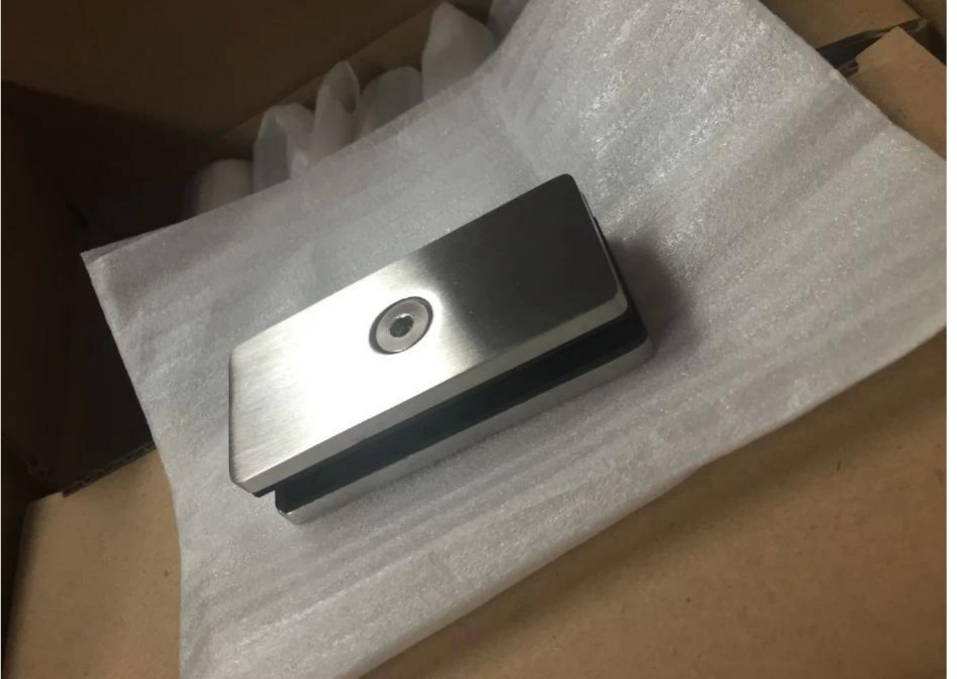
Project photos for 180 degree glass clamp