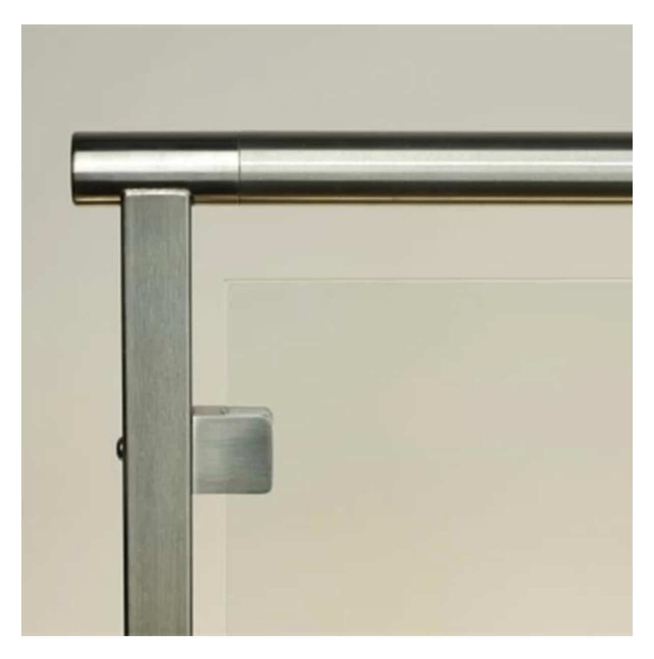
Step 2 : Check out tube size : if its round tube , please check out diameter of the tube 42.4 or 50.8 or others . We will adjust the round back angle to fit your post . If its square tube then flat back glass clamp is recommended .

Step 3: check out your glass thickness. We have different models of glass clamps for different glass thickness.