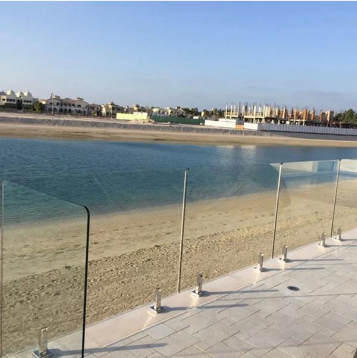
5. we also have frameless round and square core drill glass spigot