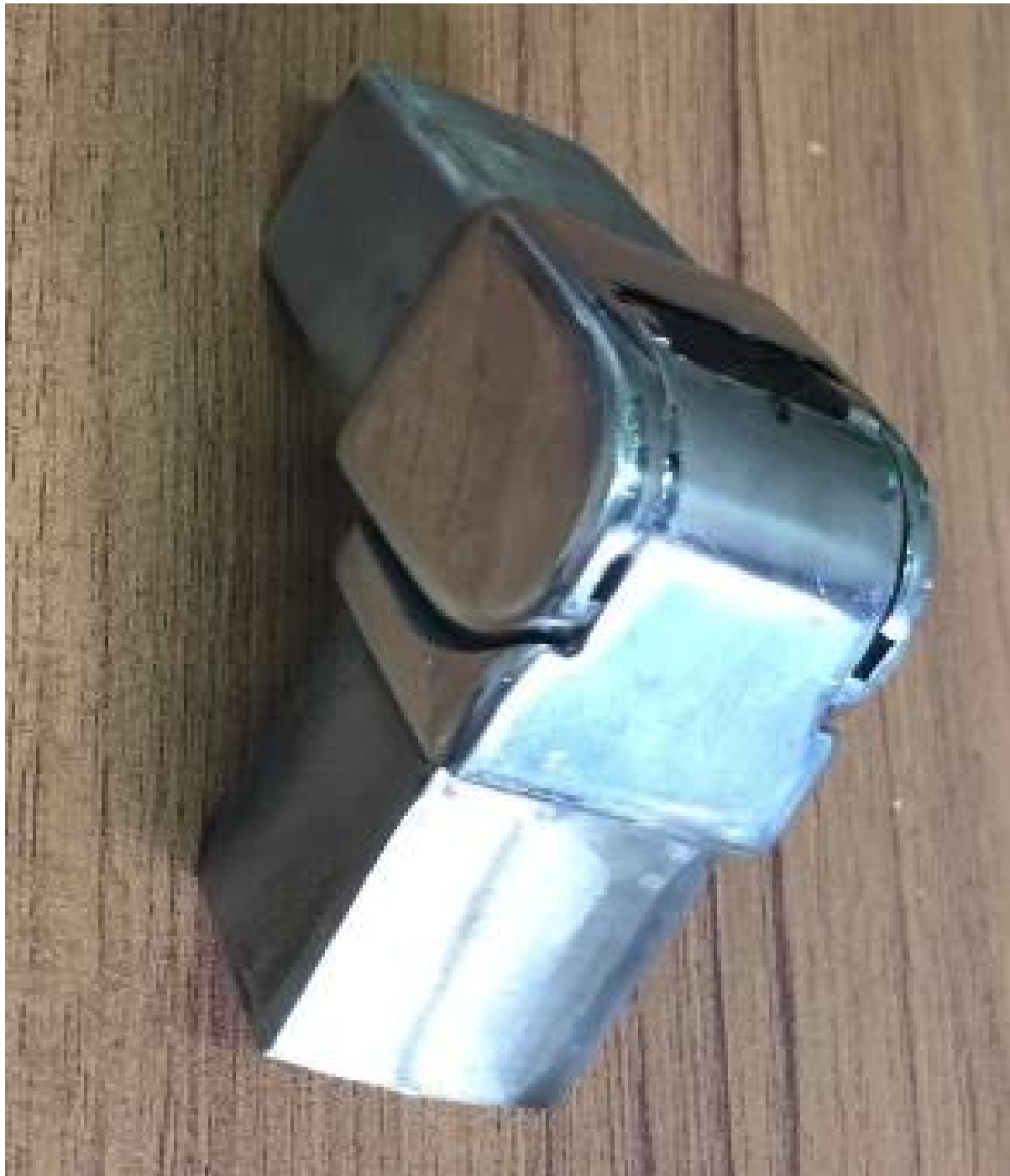
2).Left/right adjustable connector.