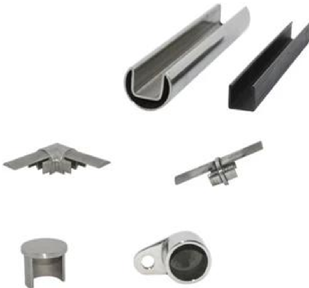
Round slot handrail series