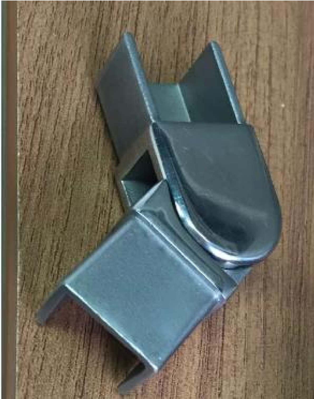
3. Frameless glass balustrade rail slot handrail fittings project: