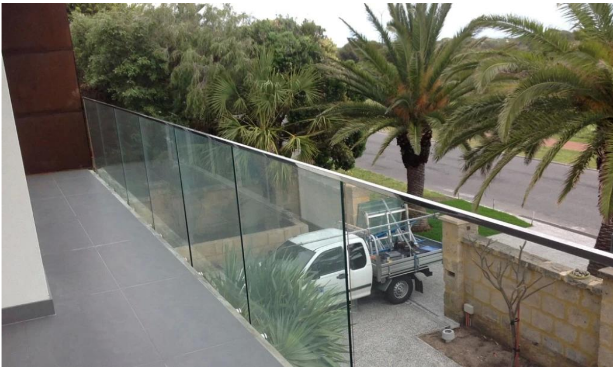
4. Glass spigot for frameless glass railing design :