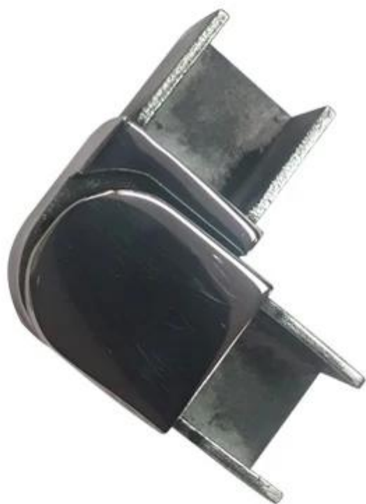
Round type slotted handrail :