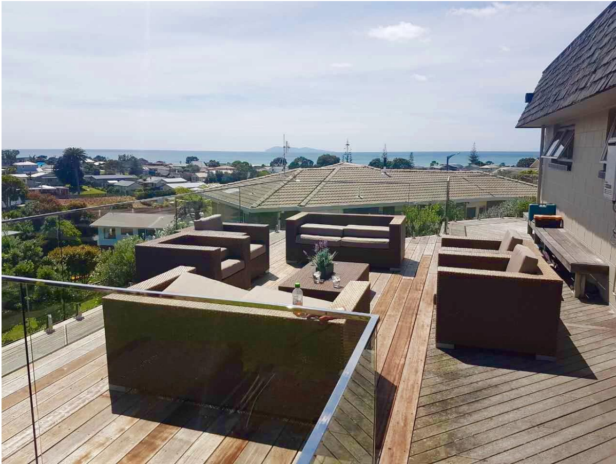
2) Indoor living modern decorative steel balustrade