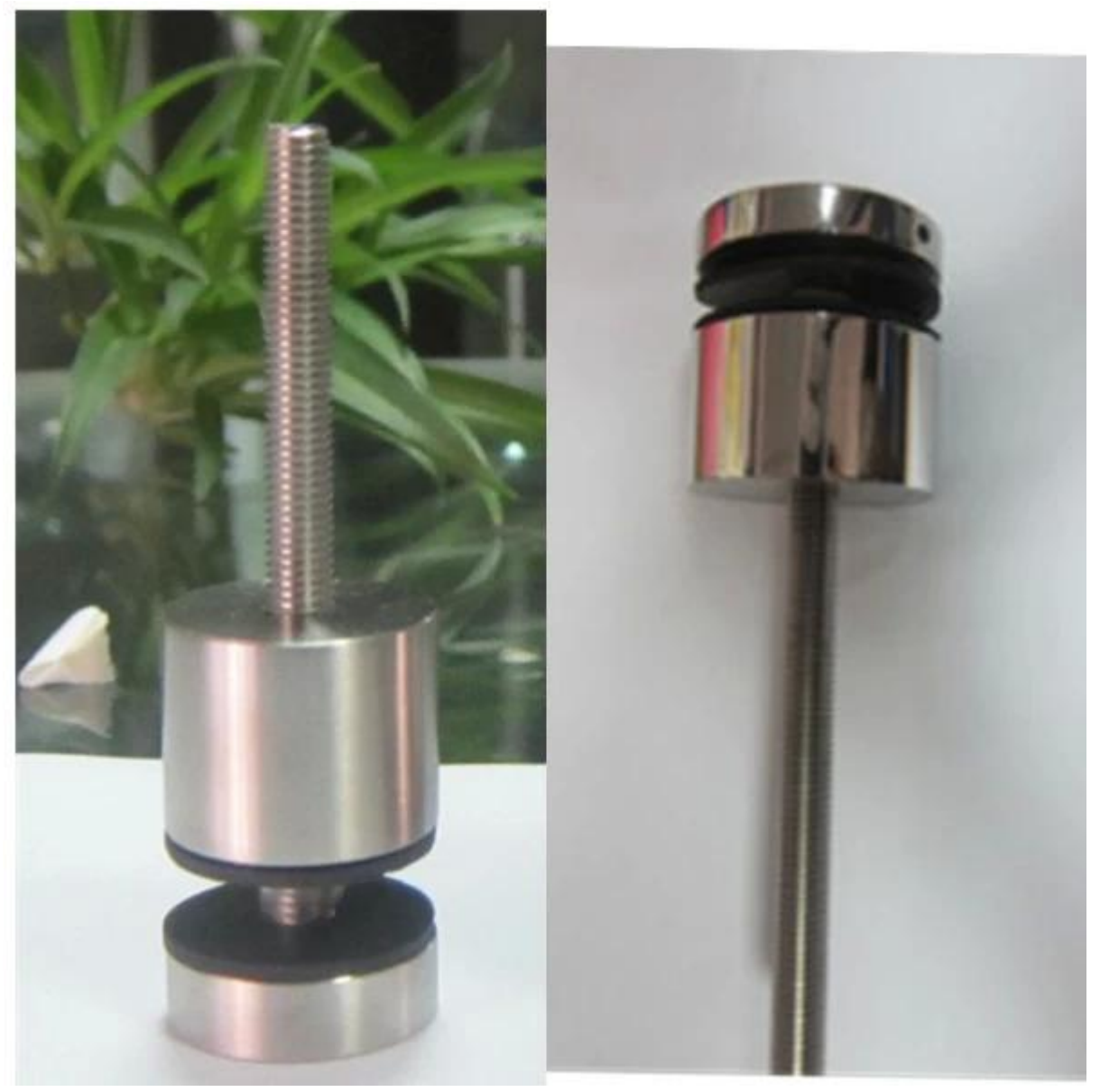
for balcony concrete decking