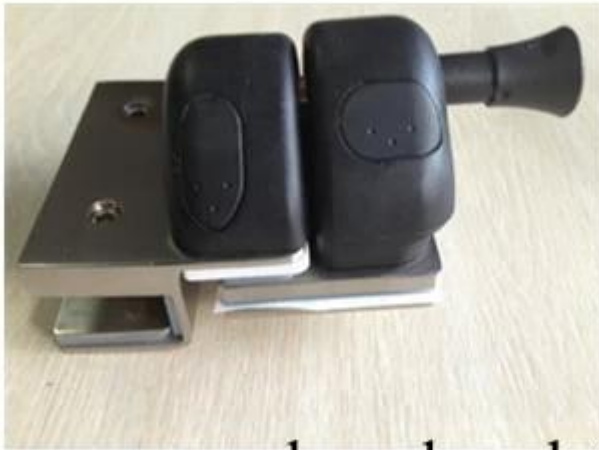
glass door latch

stainless steel glass door latch for 8-10mm pool fence, stainless steel glass door hinge and latch china manufacturer