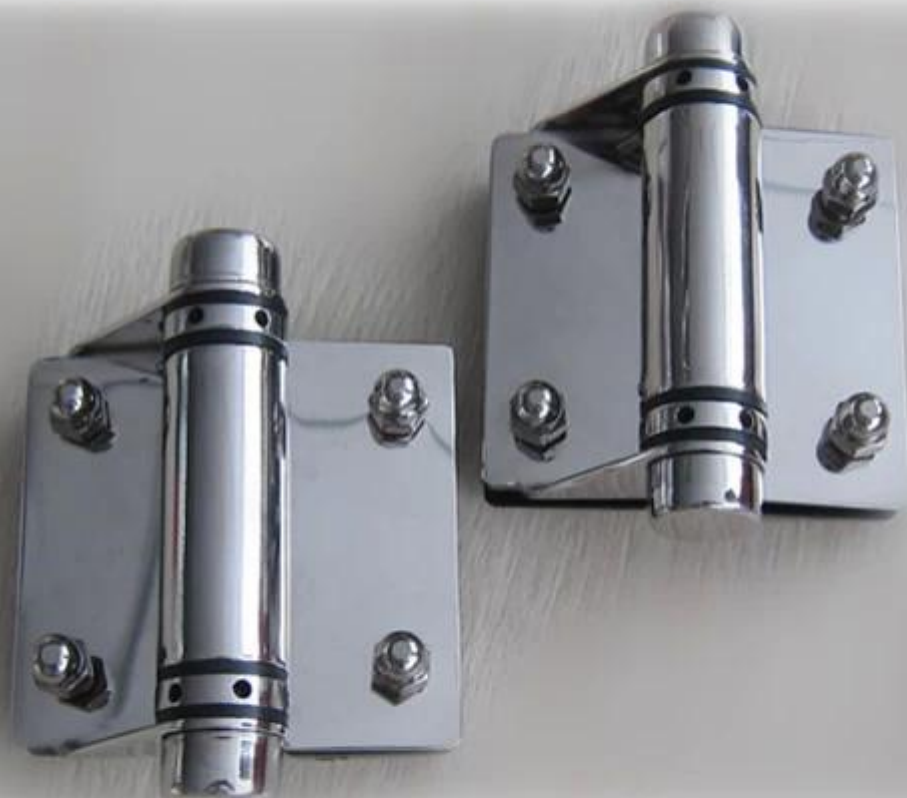
glass hinge G-G1