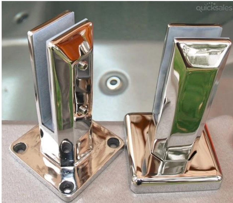
stainless steel duplex2205 glass spigot for self pool fence china manufacturer, china duplex2205 round base plate glass spigot 12mm