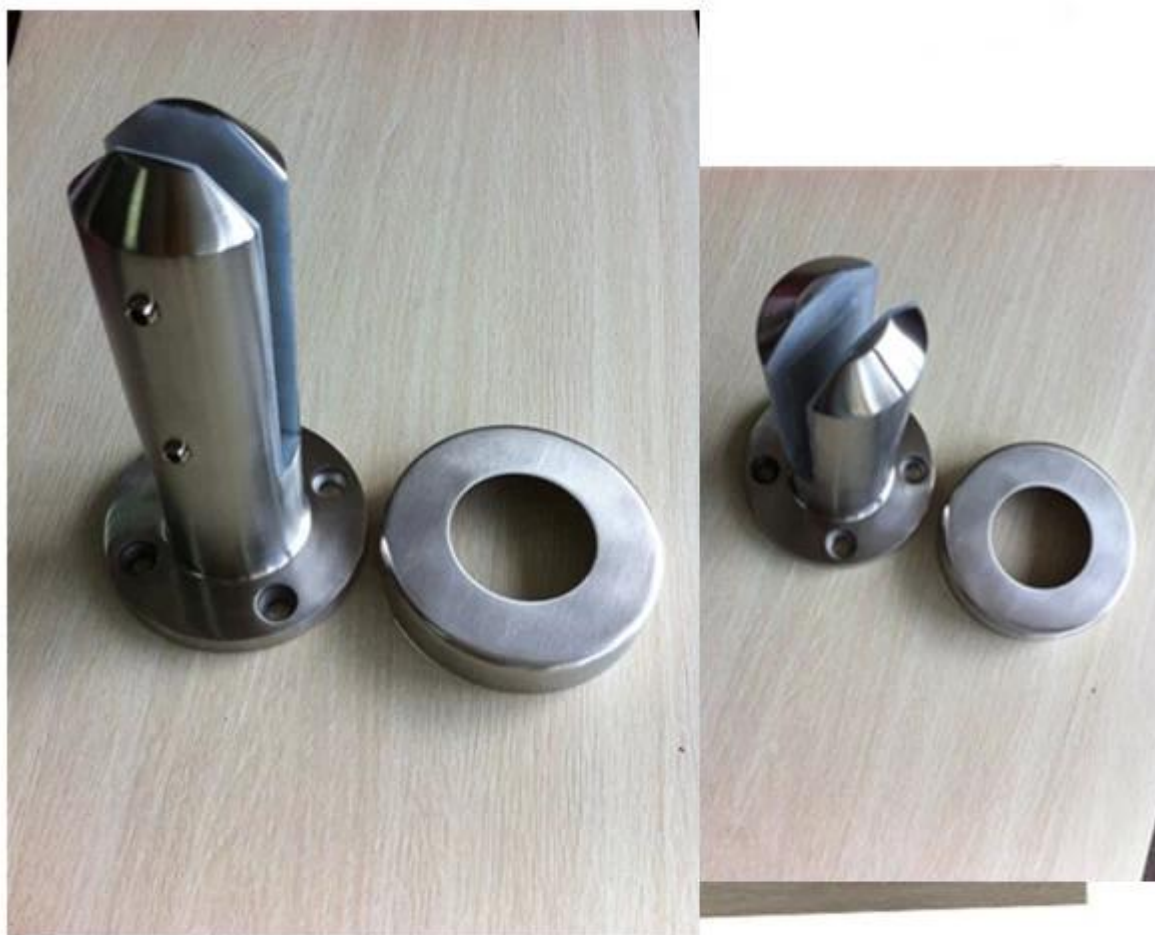
satin finish duplex2205 glass spigot