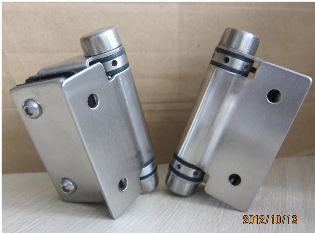
glass to round post hinge G-R1