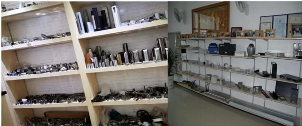
Project reference- Hot dip galvanizing parts for USA