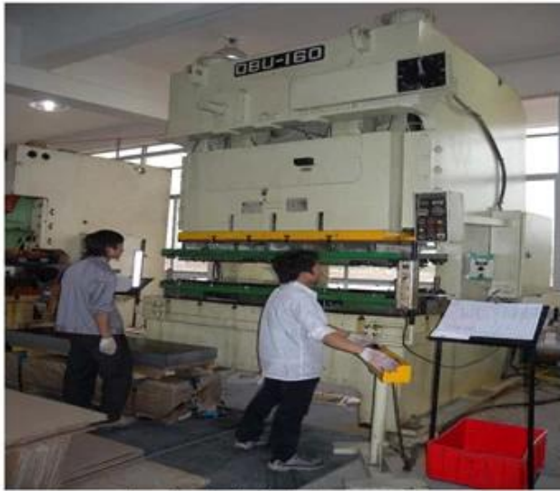
160T 宽台面冲床 模具加工尺寸800*1800mm