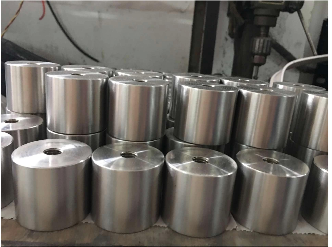
Project photos of frameless glass railings with our glass standoff bolts-