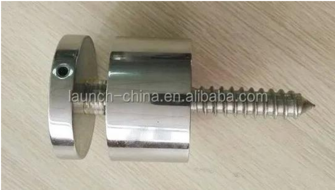
2. Model No. SF-50 standoff.