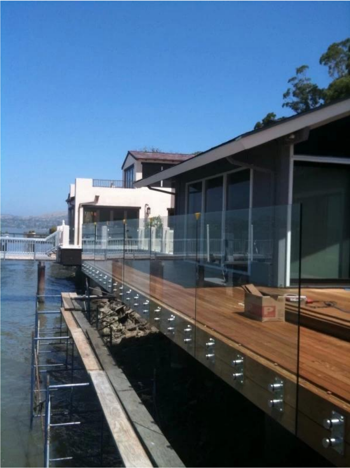
2).Stainless steel standoff staircase glass railing design