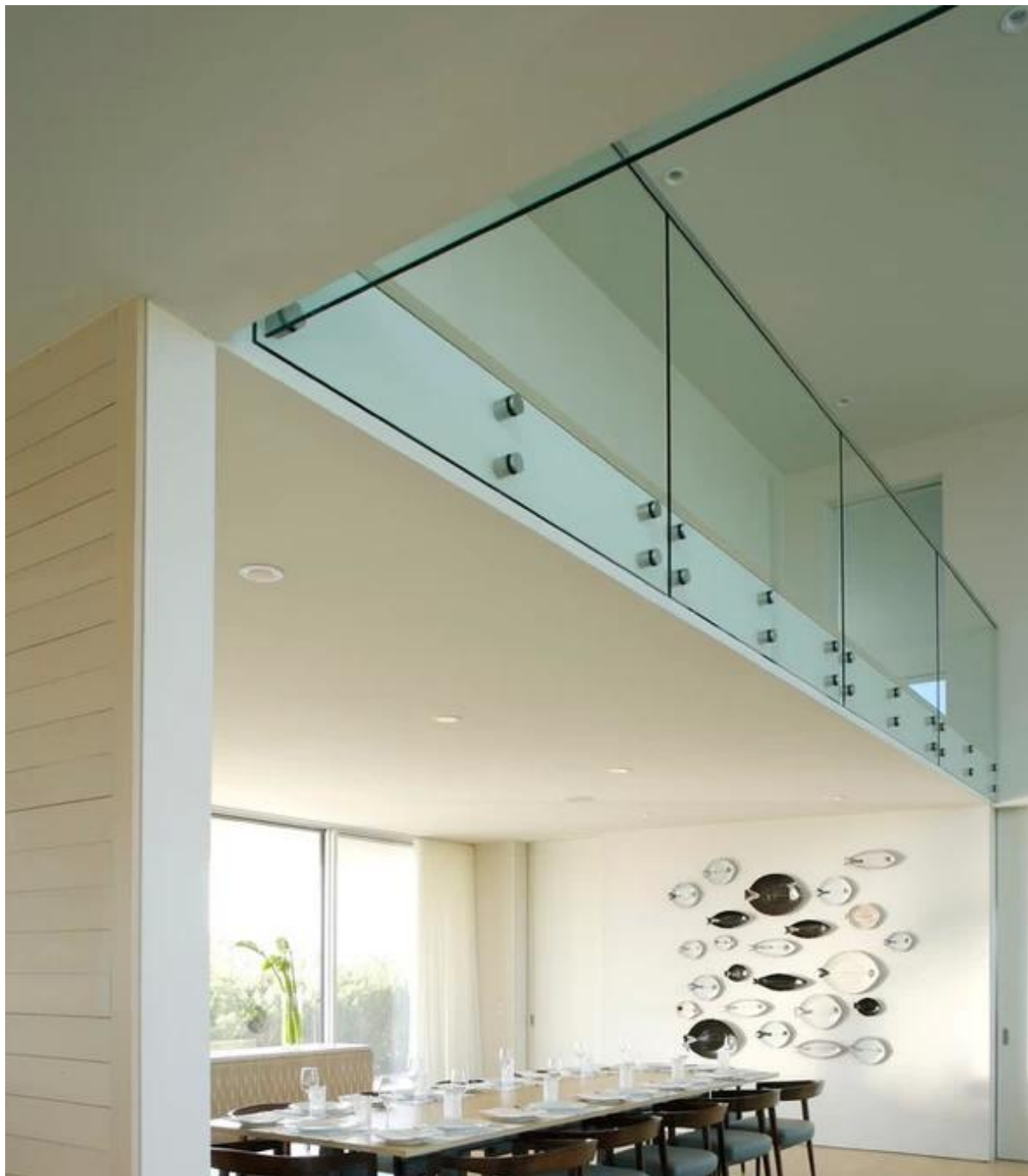
4. glass railing hardware stainless steel standoff bracket Model No.SF-50T : javascript:void(0);/*1469851036100*/