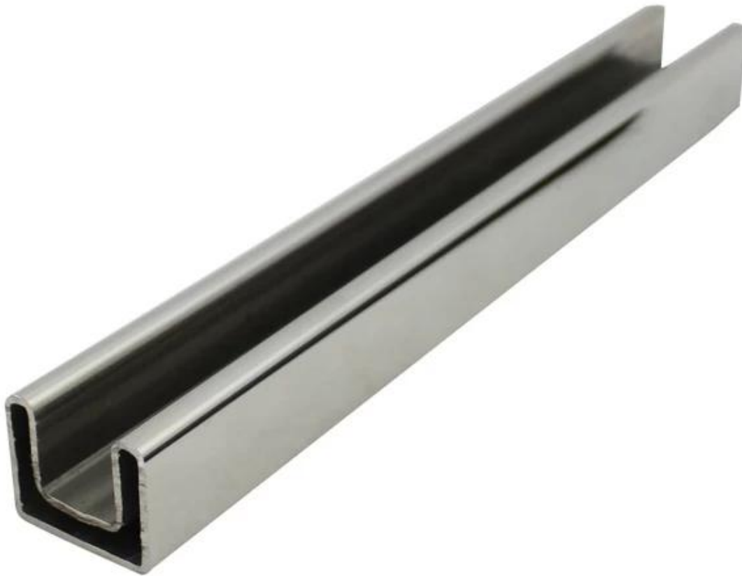
Square shape slotted handrail tube and fittings photo,