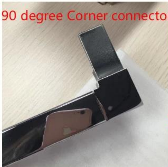
90 degree Corner connector