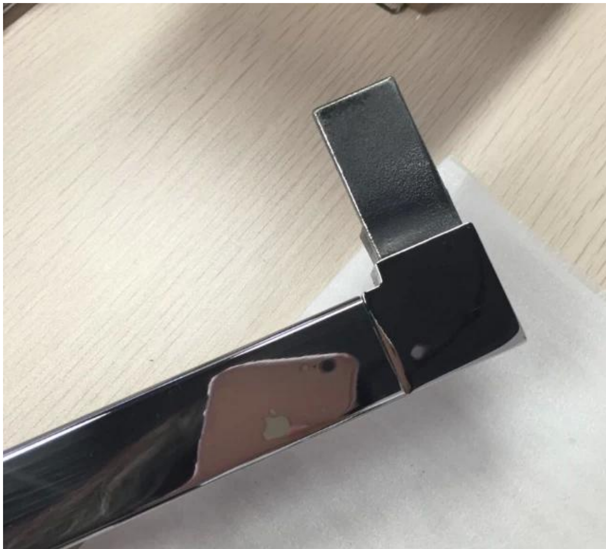
3. glass railing stainless steel top rails handrail fittings project: