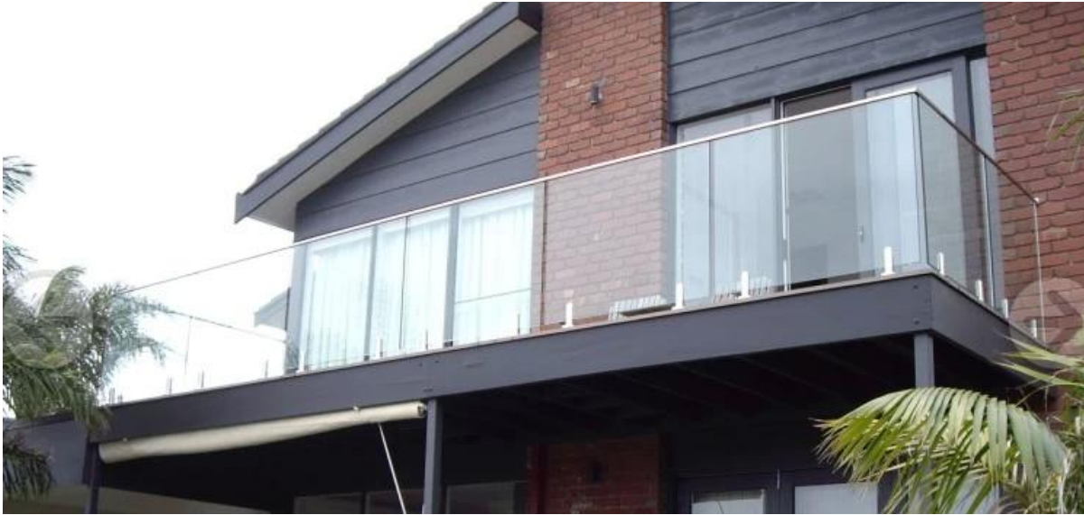
2) Indoor living modern decorative steel balustrade