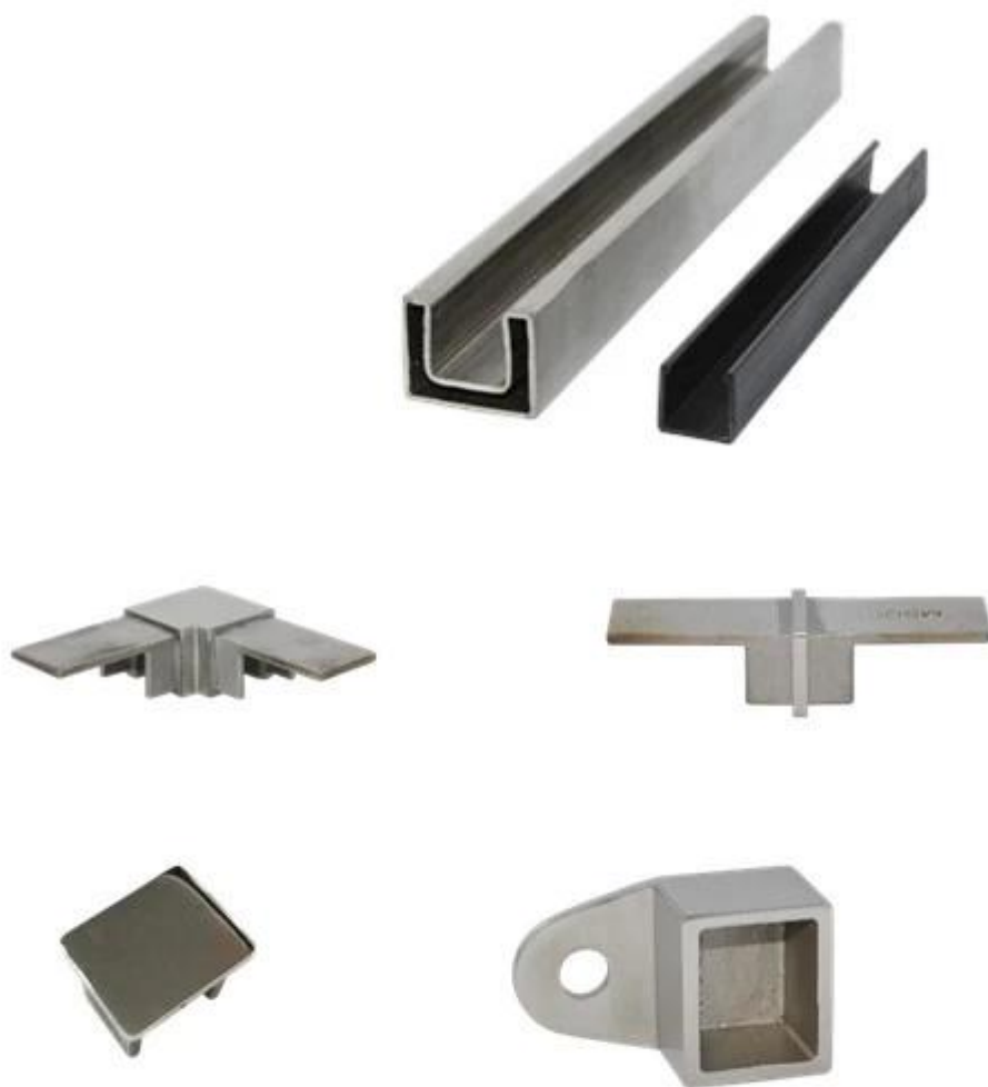
Square slot handrail series