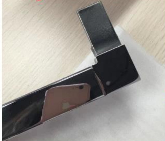
90 degree Corner connector