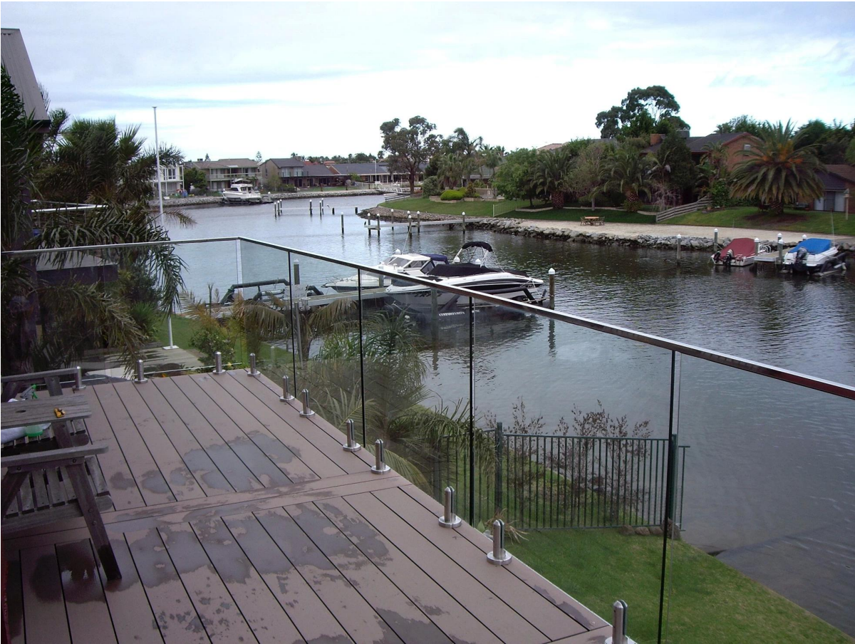
3). stainless steel handrail slot tube indoor glass railings: