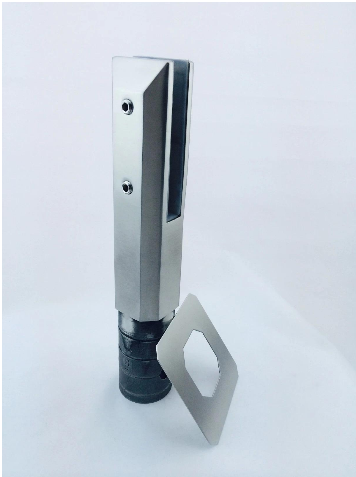
Model No.: RCM-2(round core drill spigot)