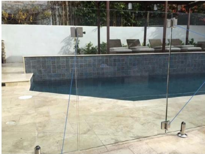
G-G2 GLASS HINGE