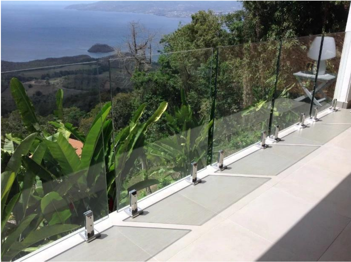
square core drill spigot Model No.: SCM-2