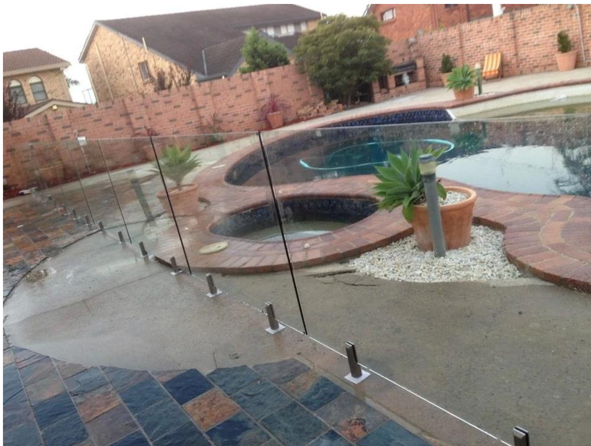
round base plate spigot Model No.: RBM-2