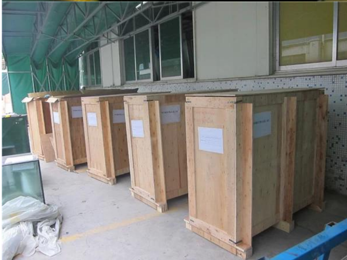
Project photos of stair railing design , stainless steel glass railings-