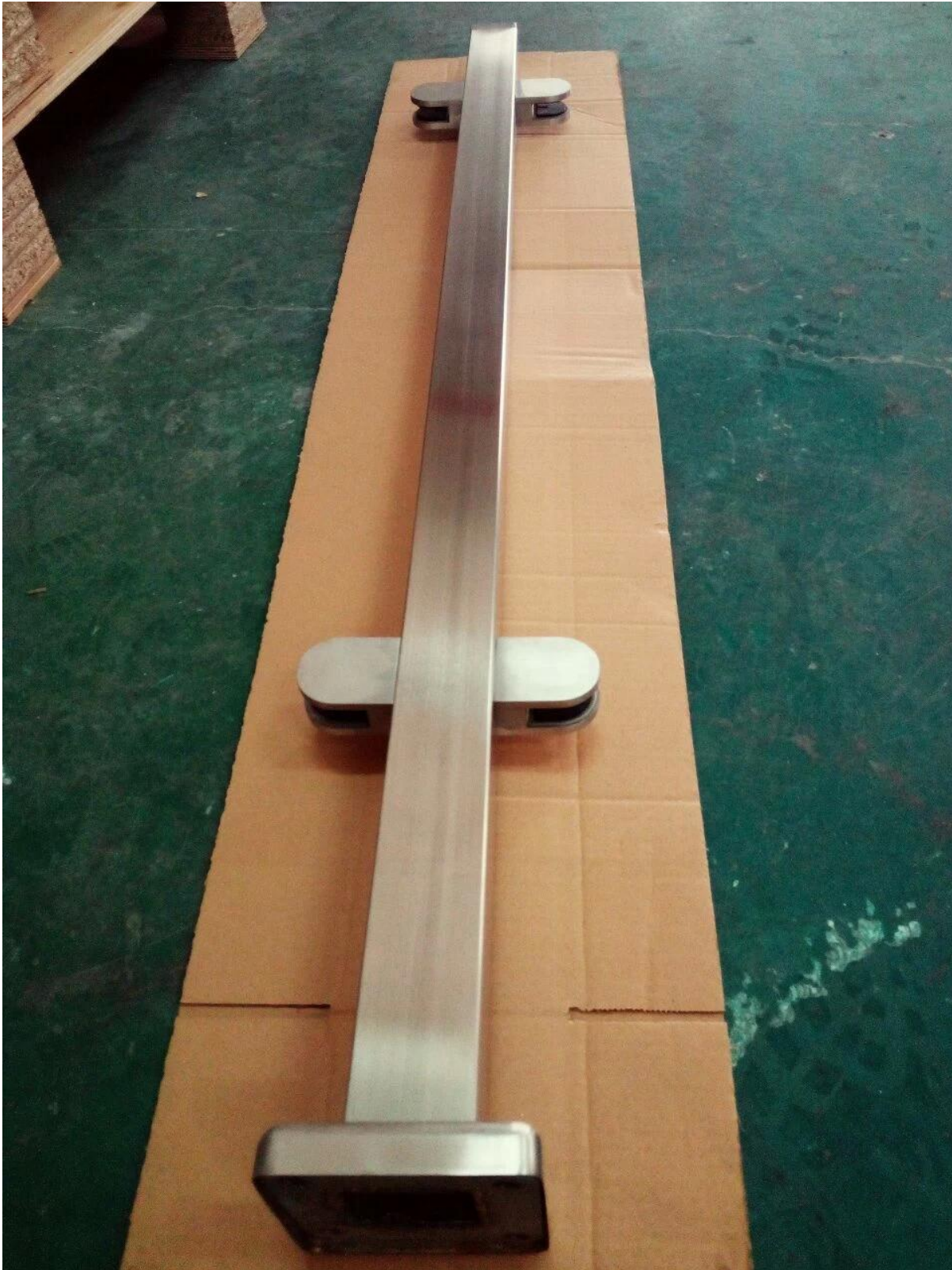
Photos of cler tempered glass -