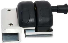
MODEL # GL-180