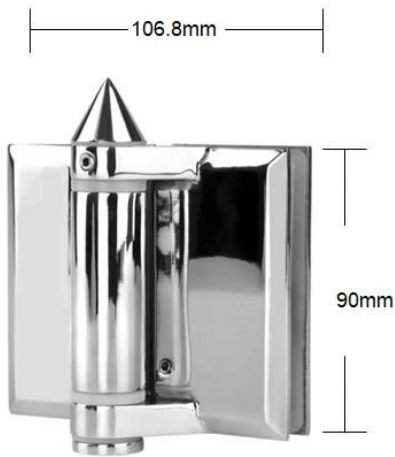
Part # G-G

Spring can be adjusted for closing speed control .