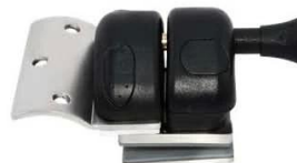
MODEL # GL-R