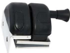
MODEL # GL-W