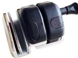
MODEL # GL-90