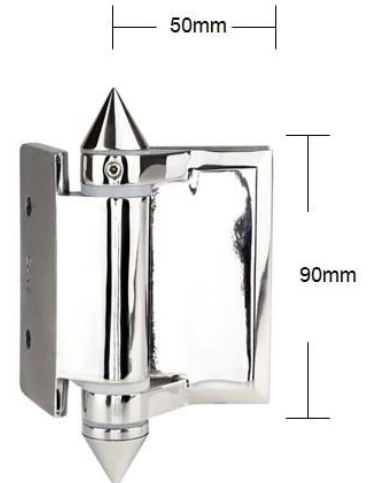
Part # G-W