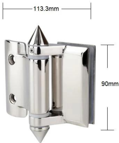
Part # G-R