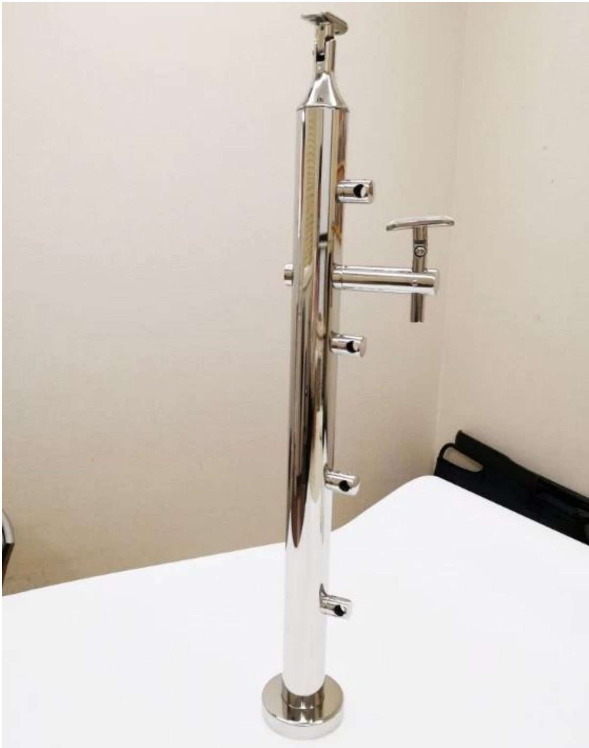
2. Photos for inox 316 crossbar railing balustrade posts