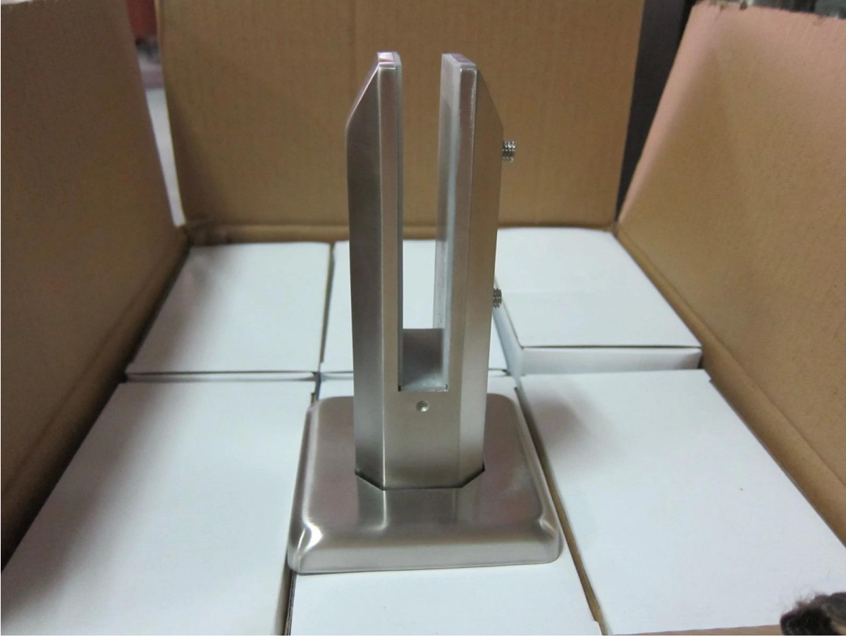
3. stainless steel frameless glass railing spigot project photos,