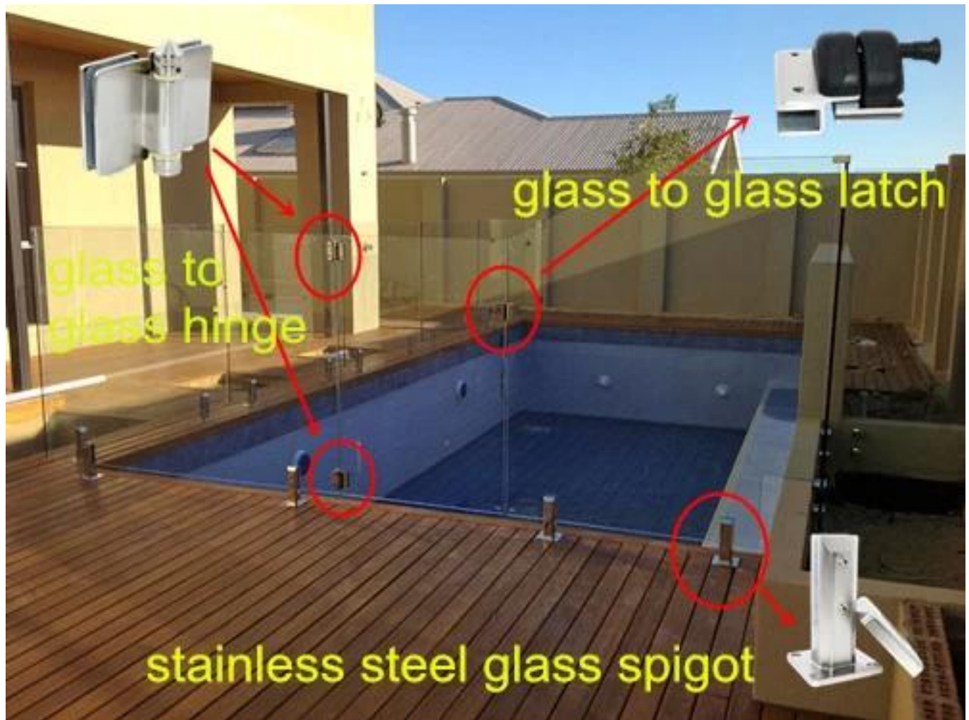
pool fencing spring loaded stainless steel 316 glass door hinge standard glass panel holes position drawing.